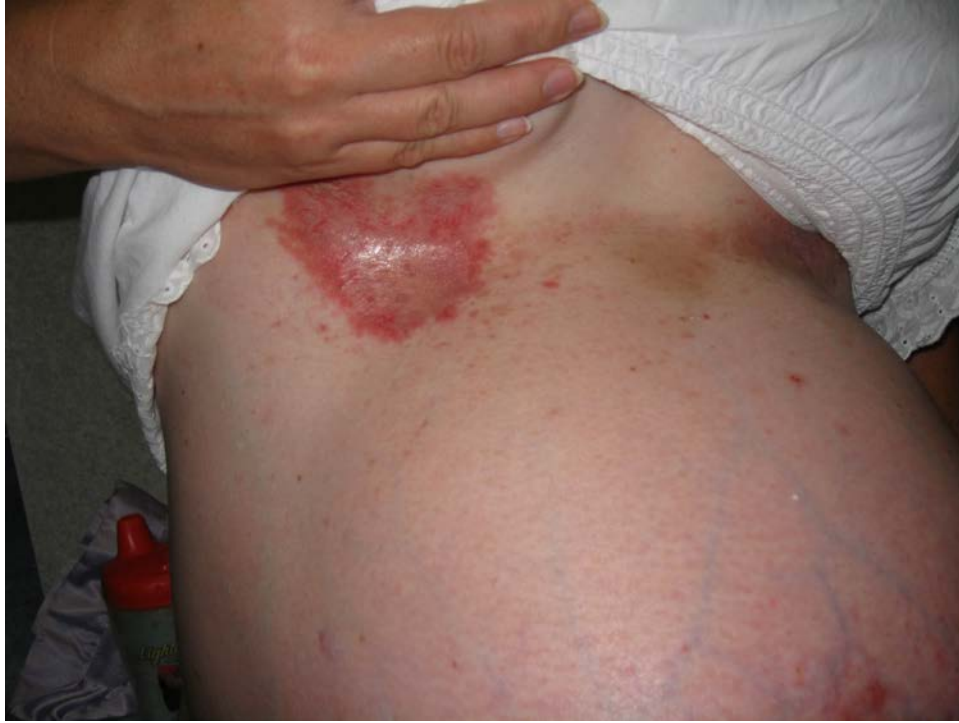
Figure 1. Erythematous, moist, fissured, macerated, eroded plaque on the right inframammary fold

pregnancy progressed. Her skin disease would typically improve significantly post partum. Family history revealed similar skin lesions in her father and sister. None of her children manifested with HHD skin lesions, but all of them were 10-years-old or younger. On physical examination, there were symmetric moist, fissured, macerated, eroded plaques on the axilla, inframammary folds, and groin (Figures 1 and 2) Some lesions were tender to palpation.