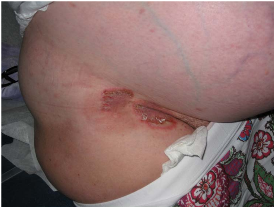
Figure 2. Erythematous, moist, fissured, macerated, eroded plaques on the right inguinal fold

Review of the patient's medical record showed a previous skin biopsy of her left axilla displaying full-thickness epidermal acantholysis (Figures 3 and 4). In addition, there was a negative direct immunofluorescence exam of biopsied skin.