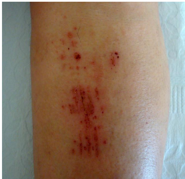
Figure 3. Excoriated, erythematous plaques on the legs (detail).