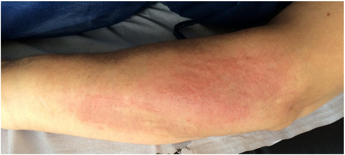
Figure 1. Well-defined, edematous and erythematous plaque on the right forearm.