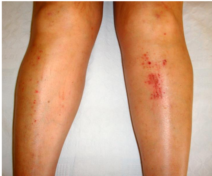
Figure 3. Erythematous and excoriated plaques on the legs.