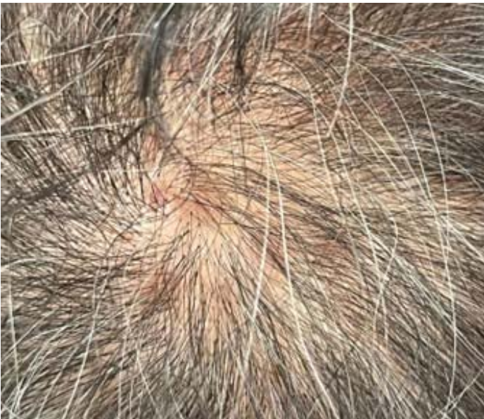
Figure 3. Resolution of plaques with residual post-inflammatory hyperpigmentation.

The differential diagnosis for erythematous plaques on the scalp is wide-ranging, with psoriasis possibly being amongst the more common. Histology is required to differentiate psoriasis from a plaque due