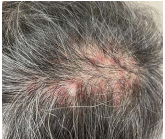
Figure 1. Erythematous plaques and nodules on scalp.

Histopathology showed interface dermatitis and marked periadnexal as well as perivascular inflammation composed of plasma cells, lymphocytes, histiocytes, scattered neutrophils and eosinophils. Intraepithelial neutrophils are seen forming occasional microabscesses and were associated with inflammatory exudate within the surface parakeratin ( Figure 2 ). Blood investigations