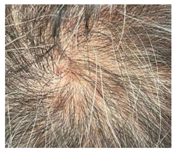
Figure 3 . Resolution of plaques with residual post-inflammatory hyperpigmentation.

The differential diagnosis for erythematous plaques on the scalp is wide-ranging, with psoriasis possibly being amongst the more common. Histology is required to differentiate psoriasis from a plaque due