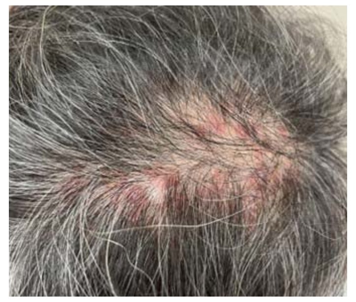
Figure 1. Erythematous plaques and nodules on scalp.

Histopathology showed interface dermatitis and marked periadnexal as well as perivascular inflammation composed of plasma cells, lymphocytes, histiocytes, scattered neutrophils and eosinophils. Intraepithelial neutrophils are seen forming occasional microabscesses and were associated with inflammatory exudate within the surface parakeratin ( Figure 2 ). Blood investigations