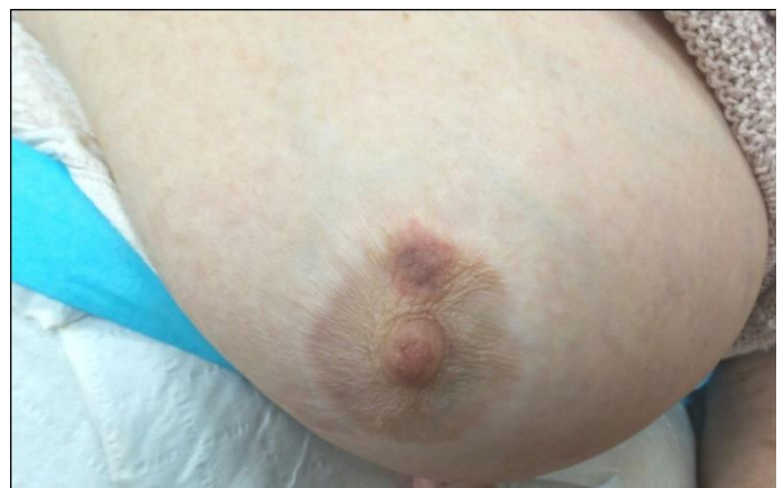
Figure 1. Pink to hyper-pigmented plaque on the upper part of the left areola with surrounding erythema and small erosions in the center

An 80-year-old woman from Cuba presented to the outpatient dermatology clinic with an asymptomatic lesion on her left breast that she first noticed two weeks prior. On physical exam, the patient had a 15mm pink plaque with central erosions and collarette of fine scale on the superior aspect of the left areola (Figure 1). The patient was previously diagnosed with RCC and treated with right nephrectomy three years prior. However, her disease had subsequently metastasized to bone, for which she was receiving infusions of nivolumab every 2