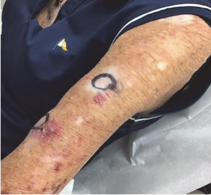
Figure 1. Circular markings outline the scattered subcutaneous nodules over the upper left extremity in which punch biopsies were taken.

She was subsequently referred to a local hospital where she was determined to have acute pancreatitis with a serum lipase of 3,302 U/L (normal range: 0-160 U/L) and an amylase of 165 U/L (normal range: 40-140 U/L). CT without contrast of the abdomen and pelvis depicted inflammation of the pancreas and layering stones in the gallbladder. The patient was admitted for supportive treatment of pancreatitis leading to the resolution and softening