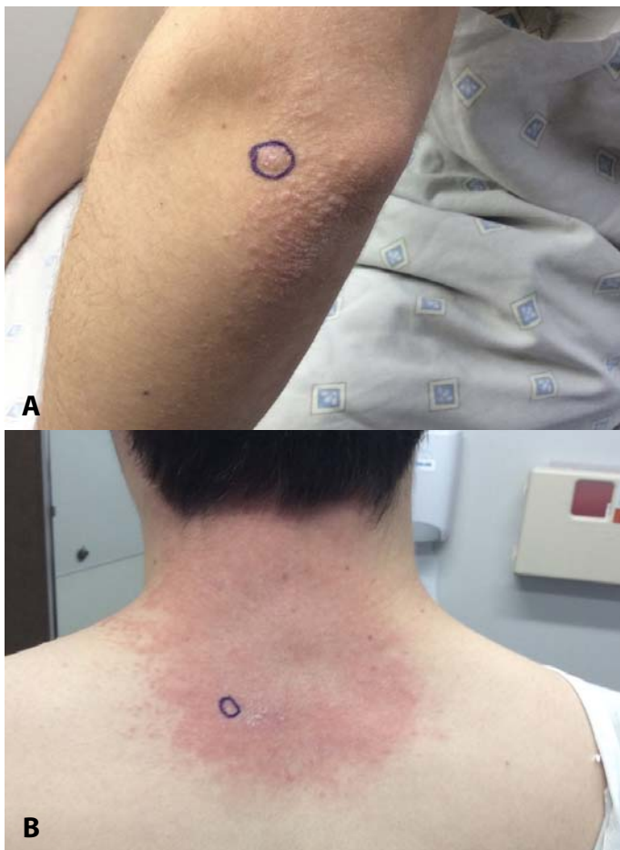
Figure 1. A) Clinical photo demonstrating multifocal erythematous plaques with violaceous papules located on the bilateral elbows, consistent with Gottron papules. B) Clinical photo demonstrating erythematous plaques on the patient's posterior neck of morphology consistent with the shawl sign.

Needle electromyography was performed on muscles of the right extremities and revealed spontaneous fibrillation potentials and positive sharp waves in proximal muscles consistent with myositis. He began intravenous methylprednisolone therapy and then was started on azathioprine 50mg with sulfamethoxazole trimethoprim 160mg to decrease infection risk. The patient discontinued the sulfamethoxazole trimethoprim owing to an allergic reaction. Given the constellation of clinical symptoms and positive NXP-2 antibodies, paraneoplastic dermatomyositis was considered. Subsequent testicular ultrasound revealed no appreciable changes or abnormalities. A CT of the abdomen and pelvis was also unremarkable. Ultimately, the patient began intravenous immune globulin (IVIG) therapy. At his two-month dermatology clinic follow-up visit the patient reported marked improvement. Scaling of the patient's face resolved, though the rash was still visible on his elbows and neck. Although his work-up for malignancy has been negative to-date we will continue to monitor.