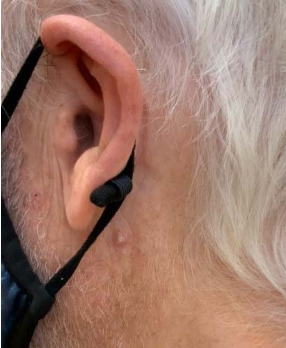
Figure 1. Squamous cell carcinoma of left post-auricular scalp, site of superficial tangential shave biopsy.

atorvastatin 10mg, fish oil 1200mg, lutein 25mg/zeaxanthin 5mg, and tramadol 50mg. The patient held his fish oil on the day of the biopsy and until two days after.