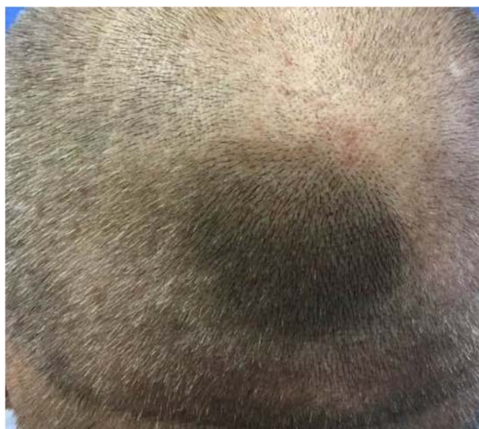
Figure 1. Gross appearance of a well-circumscribed area on the occipital scalp with new multigeminate hair formation.

immunotherapy the patient experienced a transient alopecia which self-resolved and upon regrowth of the hair he noticed a dark patch of hair on the occipital scalp. The patient denied any hair or scalp discoloration issues prior to the start of the regimen. On physical examination, there was a 45×35mm well-circumscribed area on the posterior scalp ( Figure 1 ). Dermoscopy showed multiple hair shafts derived from the same follicular units resulting in an apparent darkening of the hair and scalp related to increased hair density with no darkening or hyperpigmentation of the scalp itself ( Figure 2 ). The patient reported no issues with this irregular hair growth and was continued on his regimen without alteration.