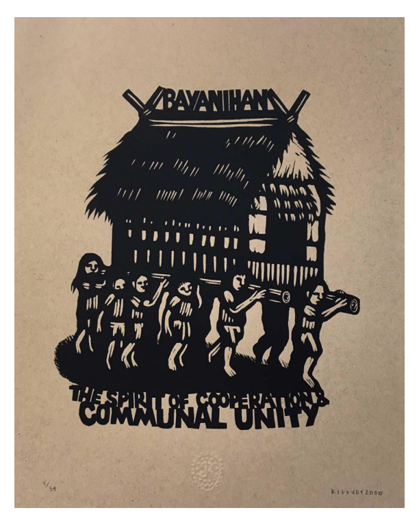
Figure 5. Bayanihan. (Screen Print by Kill Joy, Bayanihan, December 2020, https://justseeds.org/product/bayanihan/). Designed for Instituto Bogotano de Corte (ig:@institutobogotanodecorte); handpulled screenprint by Reboprints in Austin, Tejas. (ig:@reboprints).

Bayanihan, let us remember who we are, let us come back to ourselves, let us find our way home