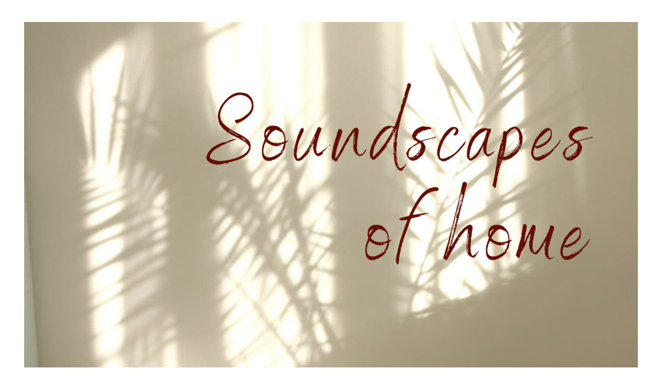
Figure 3. Soundscapes of home (presentation screenshot by the Pahinga Collective, Soundscapes of home, April 16, 2022).

Mau: Through the co-creation of what we have called our "Soundscapes of home," we drew wisdom from the motherland... like the heavy rainfall in Roxas that teaches us about stillness and time, or the seeds and plants we grow that teach us about rootedness.