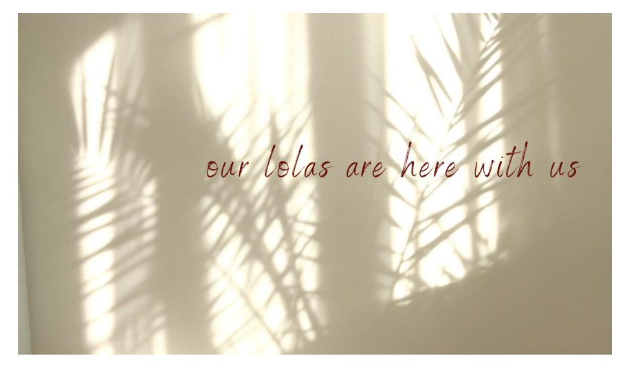
Figure 2. Our lolas are here with us (presentation screenshot by the Pahinga Collective: our lolas are here with us, April 16, 2022).

Jhona : What if we brought our plants and our pets into this space? Our salabat,11 our malunggay tea, our blankets? What if we incorporated ASMR (Auto Sensory Meridian Response)?