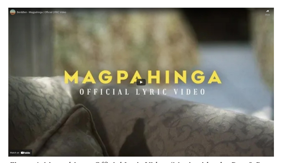
Figure 1. Magpahinga: Official Lyric Video. (Music video by Ben & Ben. Presentation screenshot by the Pahinga Collective, April 16, 2022, https://www.youtube.com/watch?v=R4GJo2pZqWc).

In the wake of COVID-19, intensified gendered and racialized violence, a growing need for mental health resources and supports for our communities, and an overwhelming sense of unrest, we welcomed the release of 9-piece OPM¹ band, Ben & Ben's² Magpahinga, a song that spoke to our collective need for rest. We were inspired to pay closer attention to this message, to listen more deeply. It is this song, and the lyric video that accompanies it, that opens our panel presentation.