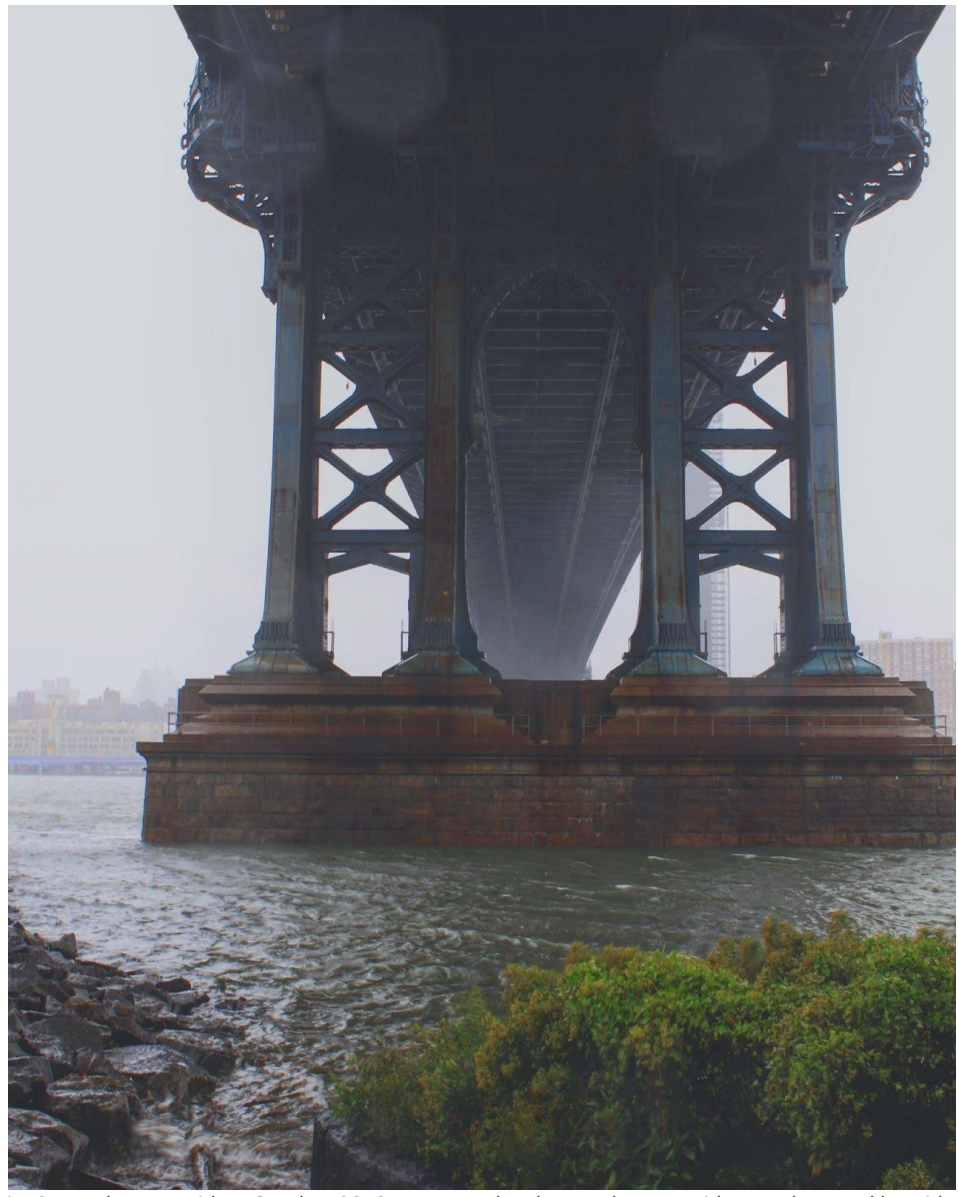
Fig. 2. Manhattan Bridge, October 2018. Down under the Manhattan Bridge on the Brooklyn side there are numerous footpaths and tidal Marshes along a path named John Street. During a driving nor'easter, I left the safety of the path and faced the tower. The conditions provided density that complements the magnificence of this 1901 structure.