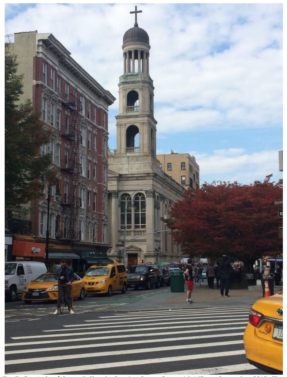
Fig. 7. Our Lady of Pompeii Church, Carmine Street Greenwich Village, September 2015. The church, a safe haven for Italian immigrants, was founded in 1892 and the building constructed in 1928. This perspective of only the three-story bell tower atop the church promotes its stature and dignity, as it stands guard over the lower buildings of the Village. The entire church can be seen from the corner of Carmine and Bleecker, but this perspective can only be seen from the entrance to Minetta Lane Triangle, bordering Bleecker Street and Sixth Avenue.