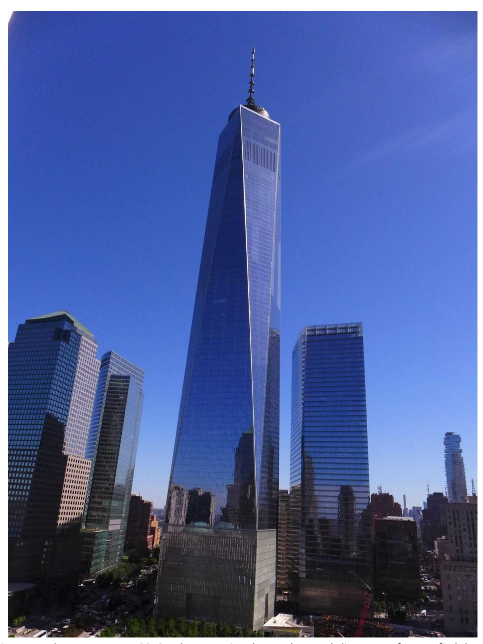
Fig. 4. Freedom Tower, June 2018. When scanning the Manhattan skyline most of us can find the top of this tower. From the street it is hard to see the entire structure. This photo was taken from the terrace of the W Hotel, located in the Financial district.