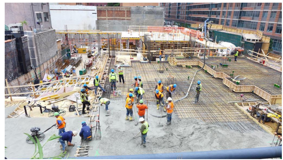
Fig. 3. Construction site for 528 West 28th street, Zaha Hadid, June 2015. View from the High Line, Chelsea. With the opening of the High Line, New York City re-zoned West Chelsea in 2015, commencing in a high-end real estate boom. This photo witnesses the birth of the fabulous condominium complex designed by the late architect at 528 West 28th Street.