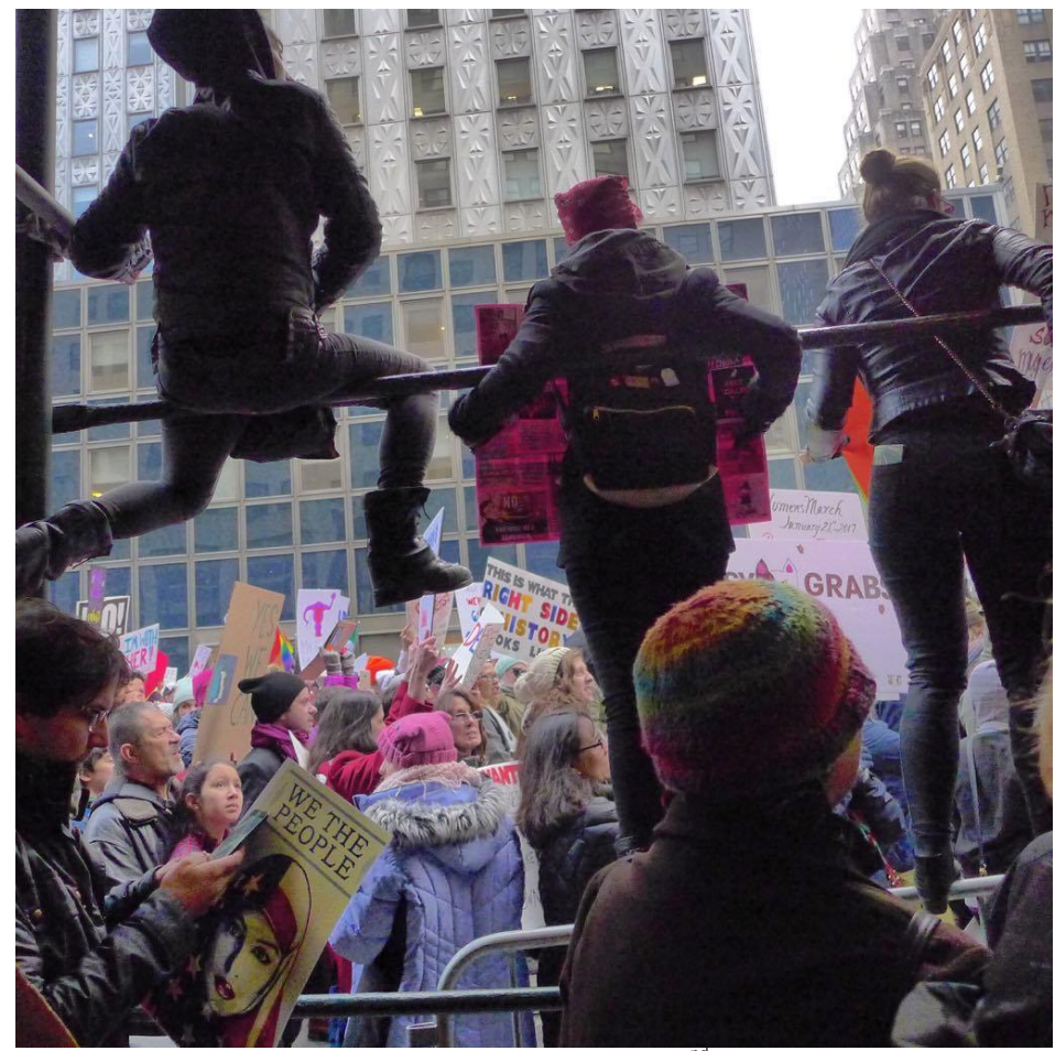
Fig. 6. Views of the Women's March, January 2017, crossing 42<sup>nd</sup> Street, Manhattan. Again, how does one manage to find the vertical vantage point to witness a horizontal event? By climbing ever-present scaffolds, constantly in use all over the city, year in and year out, to platforms for the maintenance of the city's skyscrapers and buildings.