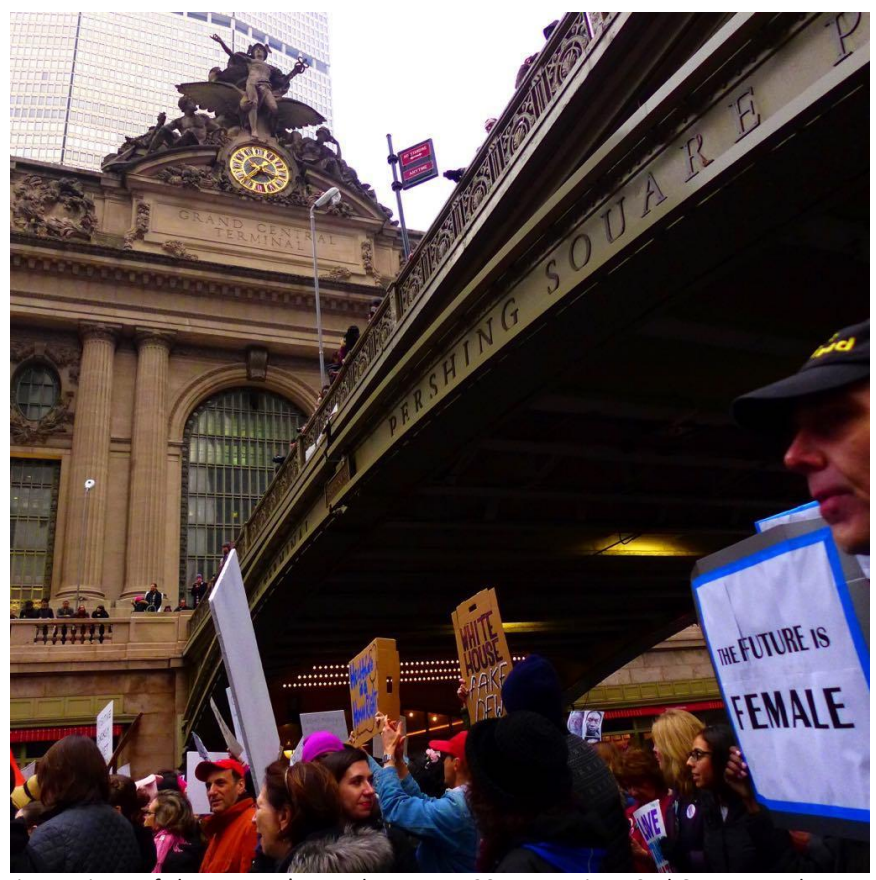
Fig. 5. Views of the Women's March, January 2017, crossing 42nd Street, Manhattan. How does one manage to find the vertical vantage point to witness a horizontal event? Grand Central Station offers an elevated street, which connects to Pershing Bridge.