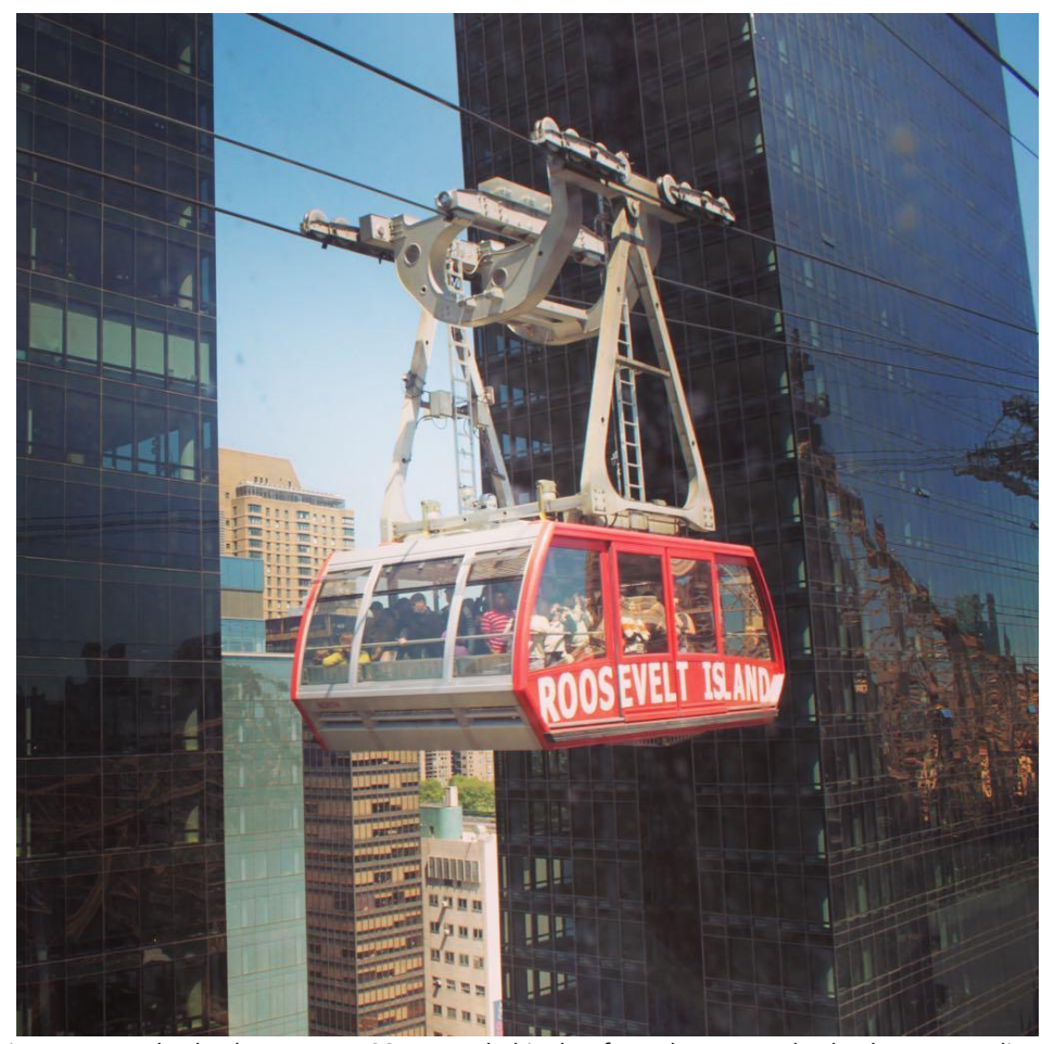
Fig. 1. Roosevelt Island Tram, May 2015. I took this shot from the Roosevelt Island Tram traveling in the opposite direction. The tram sways within, among, and above tall buildings of Manhattan. This is one way to get close, without trespassing.