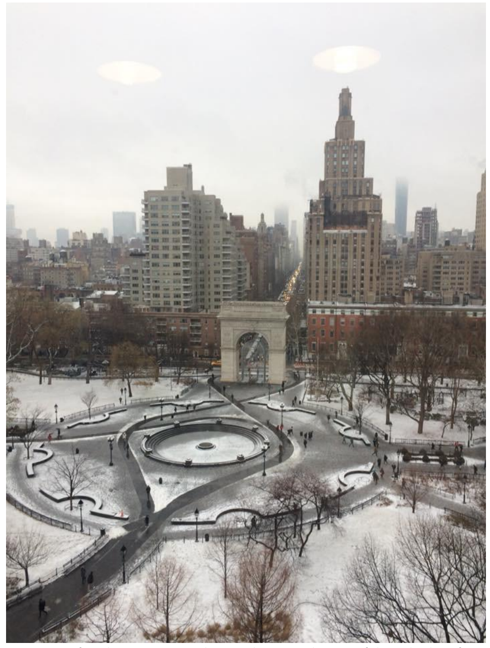
Fig. 10. View of Washington Square Park, November 2018. This view of the park taken after a dusting of snow is from NYU's Kimmel Center Building, 9th Floor. From this vantage, circular paths seem to resist the verticality of looming nearby structures.