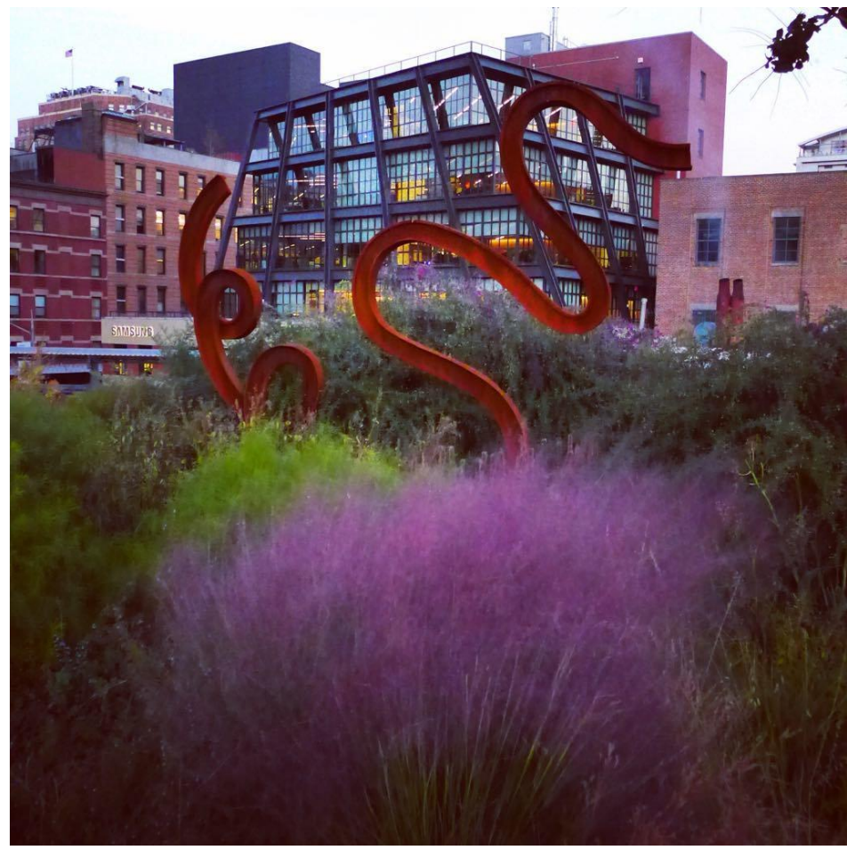
Fig. 8. The Swan (untitled), Matt Johnson, the High Line, September 2017. The High Line, a former elevated railroad has been transformed into one of Manhattan's most unique public parks, combining nature and art. The horizontal path begins in the 30's and meanders downtown, to 12<sup>th</sup> street, along the way straddling fabulous new architectural structures and providing vantage points for stunning views to factories that once were. Matt Johnson's untitled doodle whimsically breaks the horizontal path and the vertical skyline. It is constructed from a rail found on the original site.