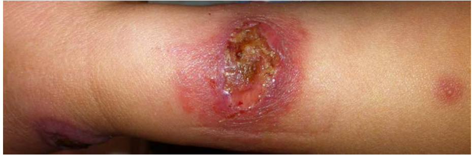
Figures 1 and 2.