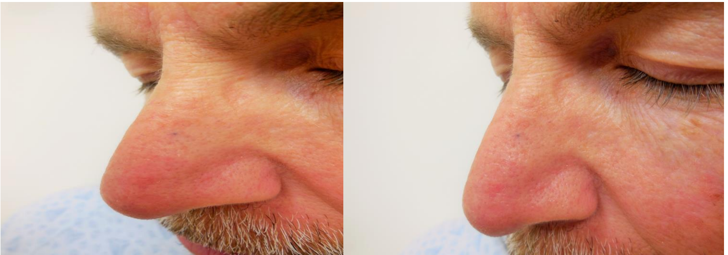
Figure 1. (a and b). Distant (a) and closer (b) tangential views of a solitary pigmented hidrocystoma of the nasal epithelium presenting as a blue, less than 1mm macule on the left upper nasal bridge.

He had been diagnosed with diffuse large B-cell lymphoma 2 years earlier for which he was successfully treated with a stem cell transplant. His past medical history was also significant for pulmonary embolism, bilateral cataracts, and hypothyroidism. He had no prior history of skin cancer. Cutaneous examination of his nose revealed a less than 1mm blue macule on the left upper nasal bridge (Figure 1). There were no similar lesions located on face or body. An excisional biopsy using a 2 mm punch was performed.