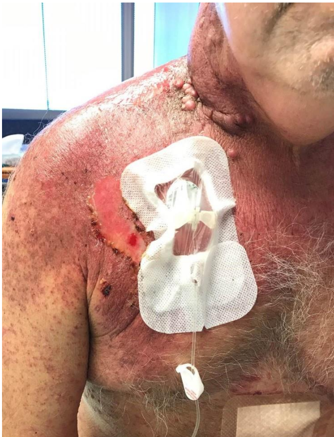
Figure 2. Desquamation most prominent on the right posterior shoulder and several 1 cm intact bullae with positive Asboe-Hansen and Nikolsky signs. In the same distribution, he had background poikilodermatous patches from prior radiation; his port was located within the area of most significant involvement as well as subcutaneous nodules from his metastatic squamous cell cancer

A 63-year-old man with a history of stage IV squamous cell carcinoma (SCC) of the uvula and soft palate was treated with neck dissection, adjuvant chemotherapy, and radiation treatment to the oropharynx and bilateral neck. He was started on anti-PD1 immunotherapy with nivolumab one day after completion of radiation. One week after the first nivolumab infusion, he developed a diffuse rash with lip crusting and conjunctival injection. He complained of worsening oral mucosal pain. He denied ocular symptoms and a full review of systems was otherwise unremarkable.