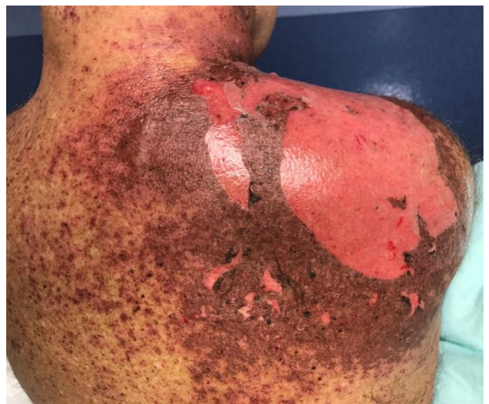
Figure 1. Confluent dusky violaceous to dark red erythema localized to the right side of his neck, right chest and right upper back involving 8% body surface area.

average mortality of 1-5%. Exfoliation relates to extensive death of keratinocytes via apoptosis, mediated by CD8+ T-cells and natural killer cells [1] through the cytotoxic secretory protein granulysin, and the interaction of the death receptor-ligand pair Fas-FasL [2]. Nivolumab is a human immunoglobulin G4 monoclonal antibody directed against the negative immunoregulatory human cell surface receptor programmed cell death-1 (PD-1), with immune checkpoint inhibitory and antineoplastic activities [3]. Nivolumab results in activation of T-cells and cell-mediated immune responses against tumor cells, but is not known to activate the Fas-FasL