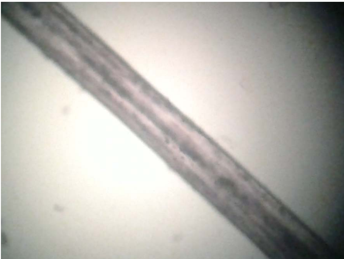
Figure 3. Light microscopy of patient's hair shafts showing clumps of pigment irregularly distributed along the hair shaft