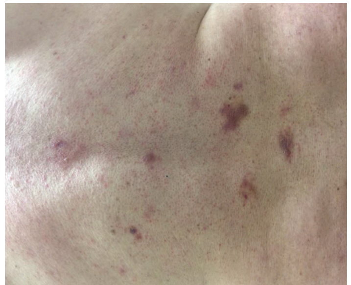
Figure 1. Multiple well demarcated irregularly shaped reddish brown plaques on the lower back.

occasionally becoming more prominent and vesicular appearing at times, but never completely regressing. The patient had no significant past medical history and was not taking any medications. Examination demonstrated multiple irregularly shaped reddish-brown plaques on the back and chest ( Figure 1 ). A biopsy was performed which demonstrated superficial dermal and perivascular deposits of eosinophilic, amorphous material, as well as a mild perivascular infiltrate composed of lymphocytes, histiocytes, and plasma cells ( Figure 2 ). The deposits were positive for thioflavin-T ( Figure 3 ), congo red, and both kappa and lambda light chains. Mass spectrometry confirmed AL amyloid, lambda type.