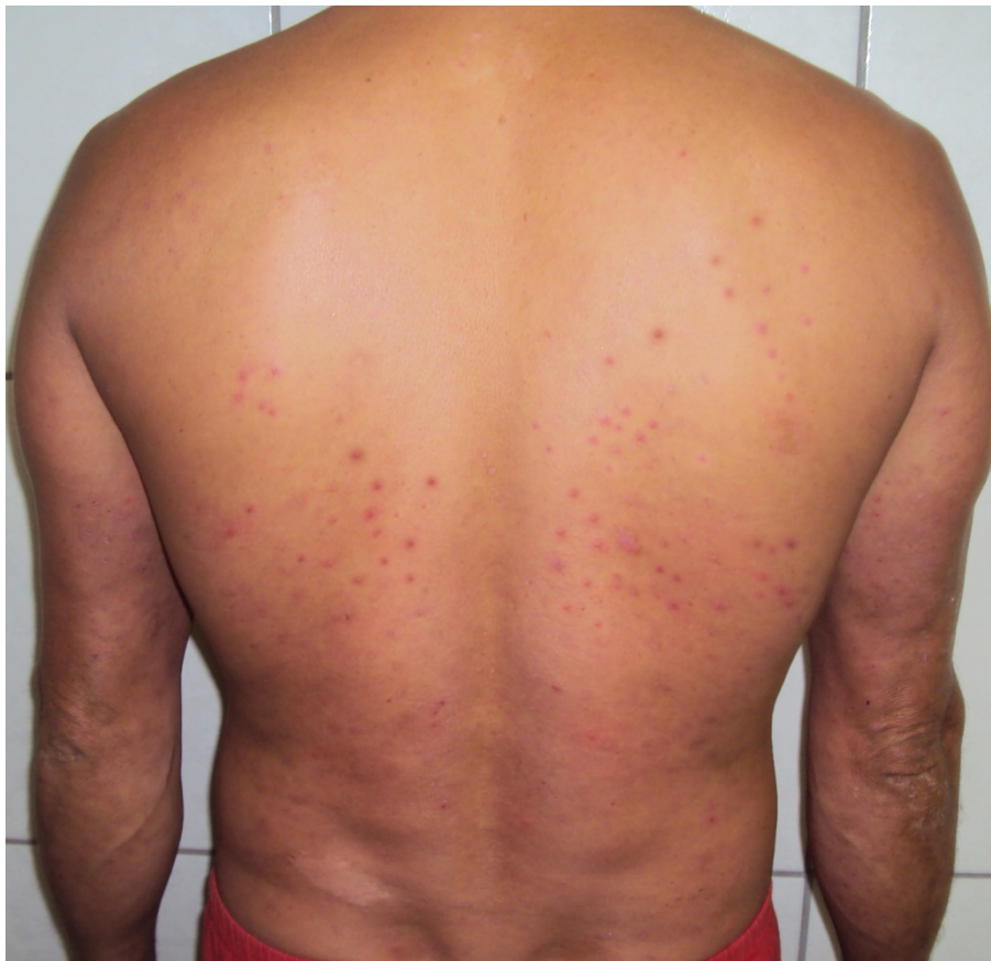
Figure 1. Clinical aspect of the lesion on the dorsum (erythematous papules and some pustules)

Based on the clinical findings and history presented by the patient, the hypotheses of acneiform eruption, bacterial folliculitis, and pityrosporum folliculitis were raised. To further investigate, biopsy of a lesion was performed.