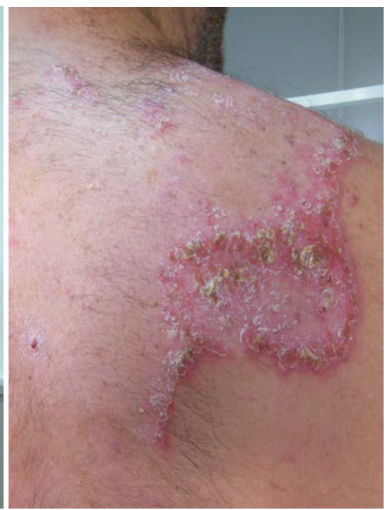
Figures 1 and 2.

A complete blood count and comprehensive metabolic panel were normal. AntiRo, antiLa and antinuclear antibodies were negative. VDRL and ELISA test for HIV were not reactive. Mycological and bacteriological direct examination and culture were negative.