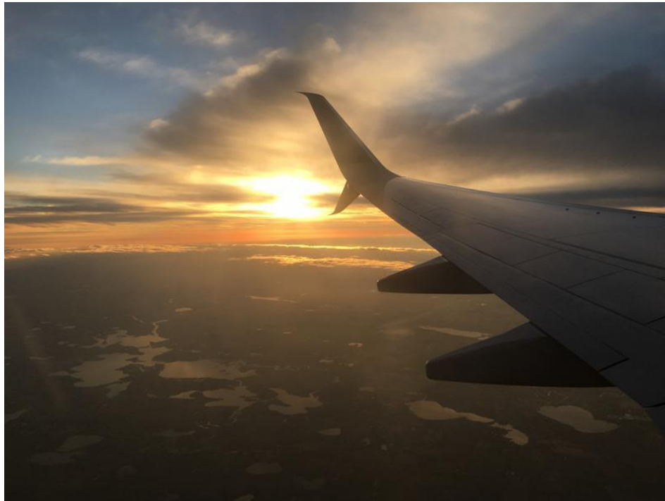
Fig. 2. Lakes of Wisconsin from the sky.