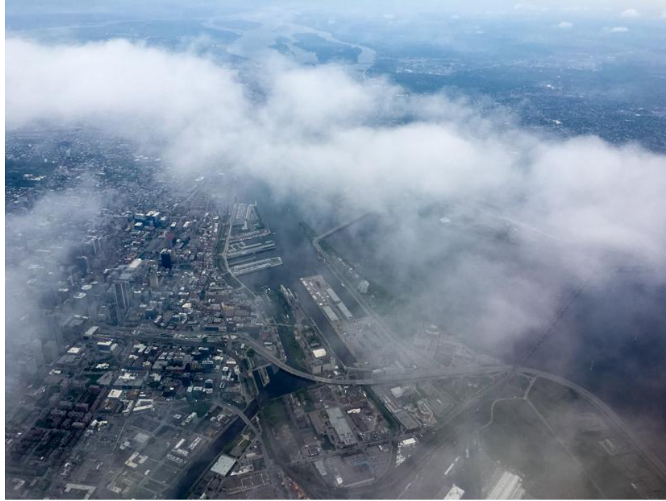
Fig. 9. Montreal through the clouds.