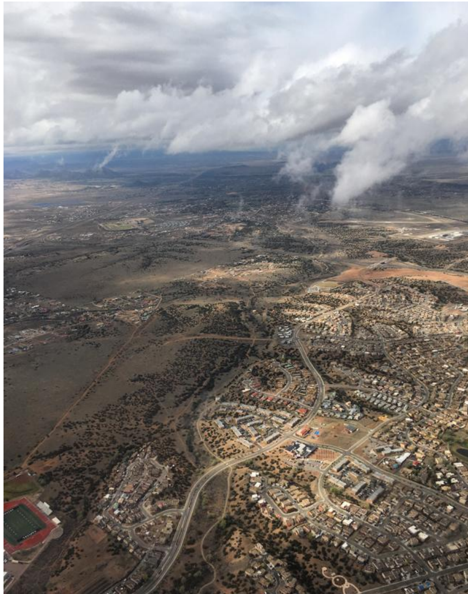
Fig. 4. Hybrid landscapes of Santa Fe, New Mexico.