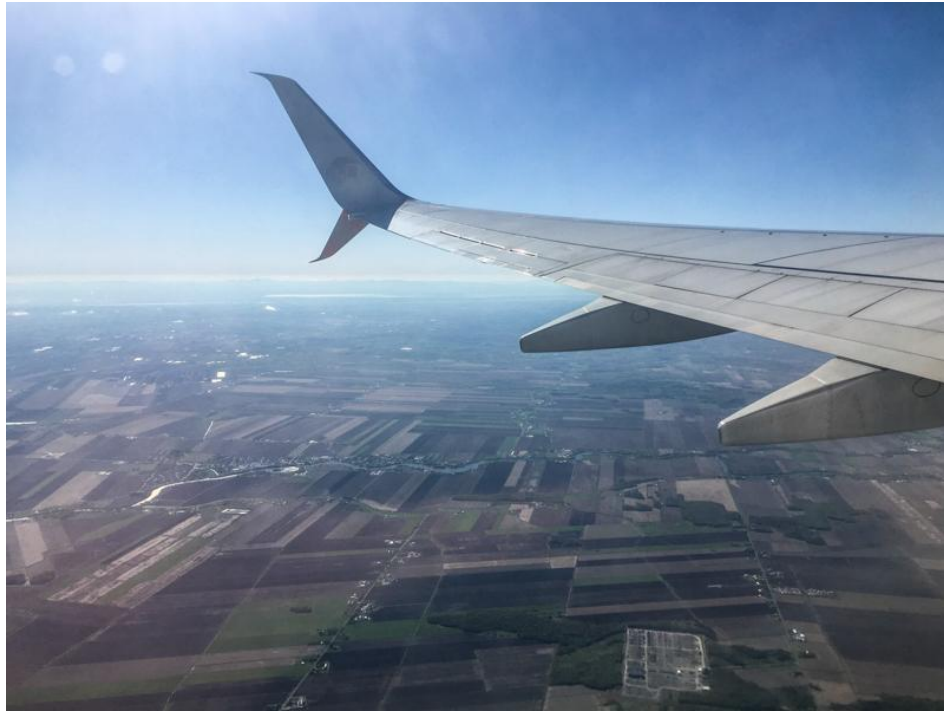
Fig. 6. Agricultural landscapes of Beauharnois, Quebec.