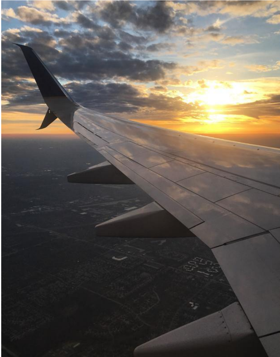
Fig. 1. Sunset over Chicago, Illinois.