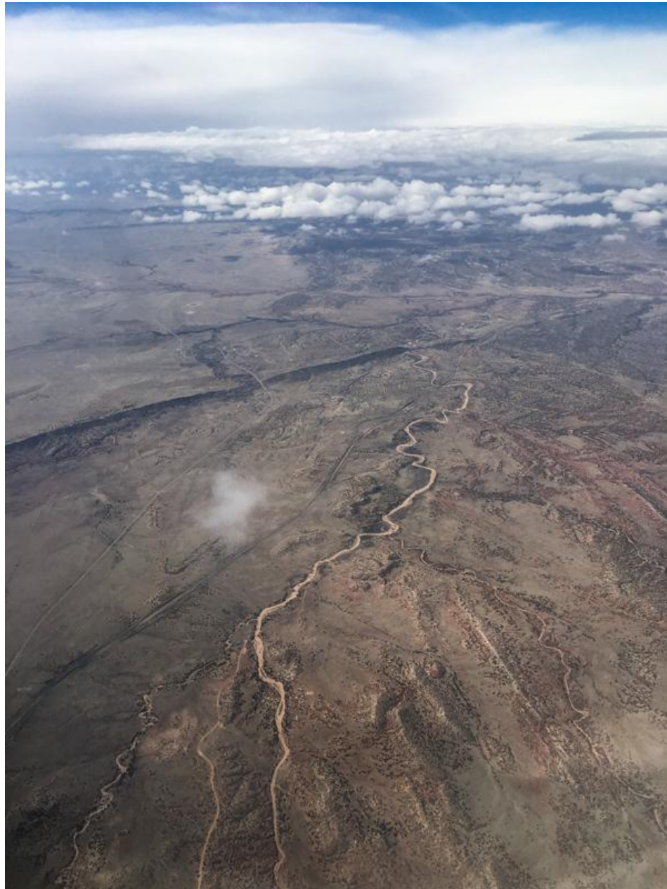
Fig. 3. Desert landscapes of New Mexico.