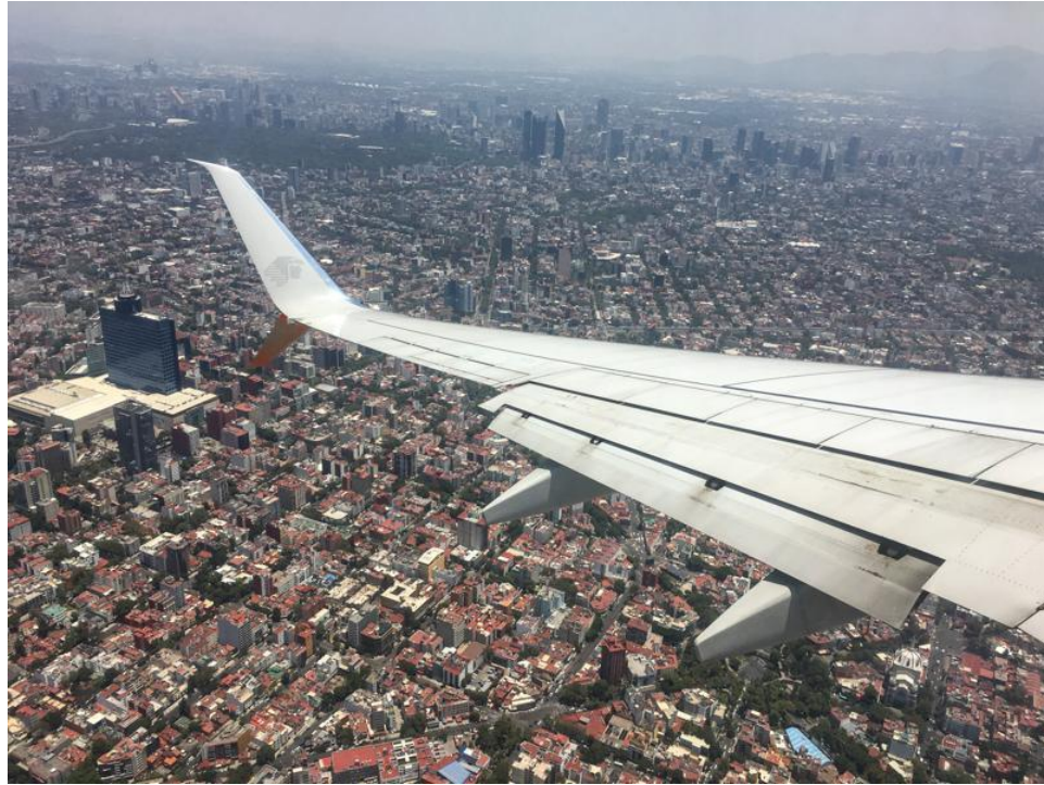
Fig. 8. Mexico City, a “modern metropolis.”