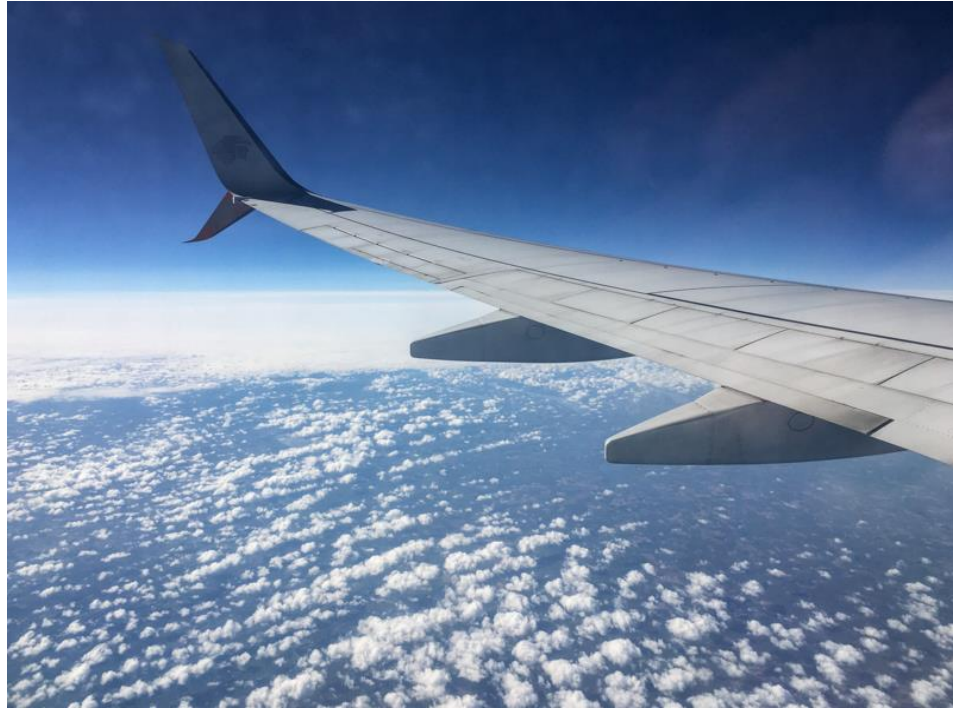
Fig. 7. Lake Ontario from above the clouds.