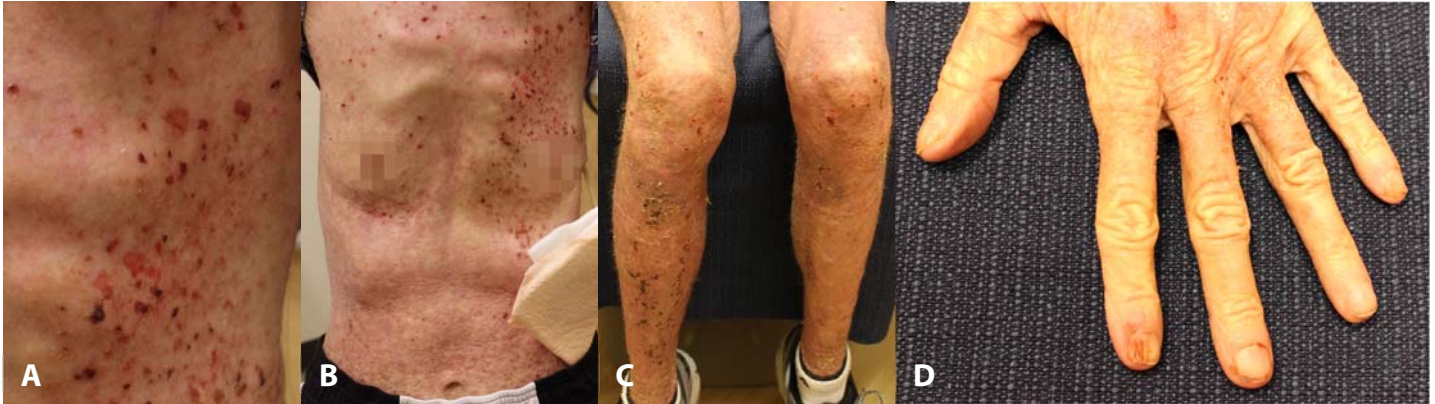
Figure 1. Clinical Findings. A) Widespread eroded and excoriated hyperkeratotic papules and plaques on a diffuse erythematous background covering over 90% body surface area, B) involving the trunk, and C) bilateral upper and lower extremities with lichenified and leathery skin texture. D) Nail findings consist of longitudinal erythronychia and distal v-shaped notching.

suprabasilar acantholytic dermatitis with corps ronds and corps grains ( Figure 2 ) consistent with a diagnosis of DD. Initiation of chemotherapy with four cycles of pemetrexed, carboplatin, and pembrolizumab along with Unna wrap and topical triamcinolone led to near complete resolution of rash and symptoms within 8 weeks.