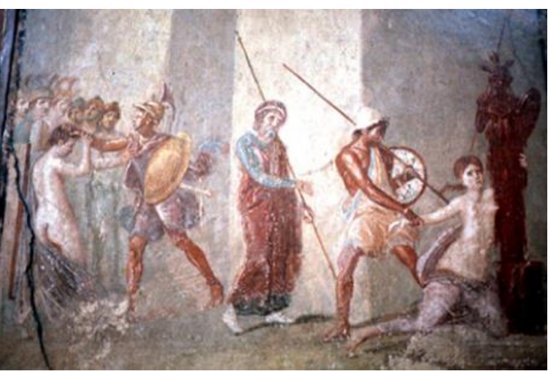
Cassandra being torn away from the statue of Athena. Fresco from the House of Menander in Pompeii. <sup>38</sup>