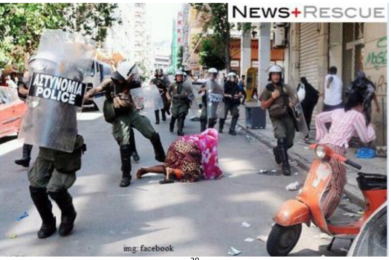
Veiled African Woman Kicked in Greece. 39

It is not a perfect play. It lacks the structure of pity and fear; it does not aspire to catharsis. It is only the crying of one of the great wrongs of the world wrought into music ,<sup>40</sup> says Gilbert Murray in his foreword to The Trojan Women .