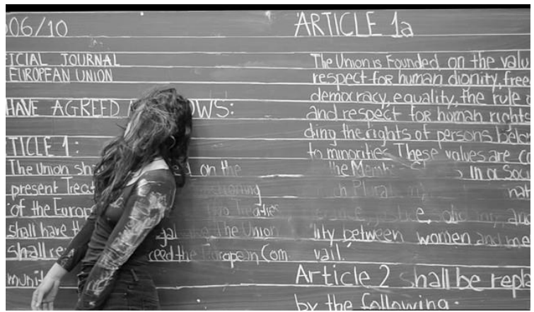
Author. 2014. Documentation of Durational Performance