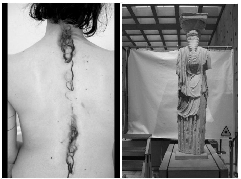
Author Establishing a Backbone 2014. Caryatid under construction at the Acropolis Museum

The skeleton of this writing is a human body, disseminated in fragments around the world. It is anonymous and following the promised words of transnationalism, its identity has been intentionally lost. Today it lies on remnants of voices, cultures, and interactions while it is embracing a dialogue that is made out of particles. Its spine is made out of smoke and it attempts to familiarize itself with the gaps between the marrow and the bones. Their distinct materiality creates an uncomfortable feeling of disjointed unity; however it's only a matter of time for them to merge down and reestablish a body. I have been thinking about my body's ephemeral symptoms as a medium of measuring my existence and its various fragmentary adaptations. As an extension of this idea, I am attempting to represent the dialectic consequences of hybridity and ephemerality.