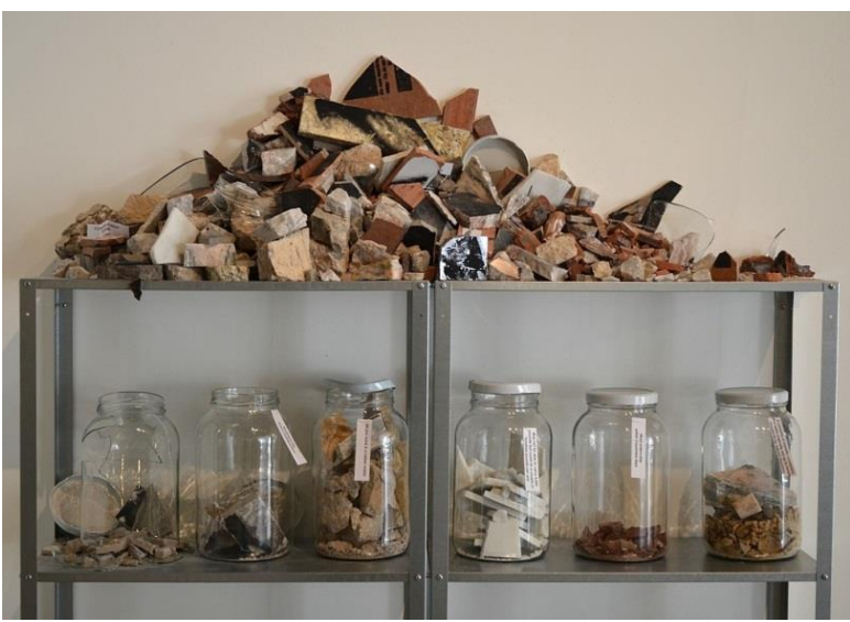
Author. They Provide Ample Storage . 2013. Silkscreened marble, pharmaceutical/archival jars, industrial commercial shelving.

The gods are observing the spectacle of sorrow as if it was their sadistic clandestine pleasure. In a similar manner, major institutions that have initiated the consequences of recovering Greece remain silent when the outcomes become too horrid to be dealt with. The oppressed subjects of the tragedy are women who are socially disadvantaged because of their gender. They embody the passport-less inhabitants of a country that is buried under bloodstained soil. They are obedient to the Greek invaders because simply they have no other choice. Similarly, the current refugees and immigrants who escape to Greece are coming from lands where life is unbearable and once they arrive are exposed to a violence they had not yet imagined. Fascist aggression limits their movements in the city, their participation in events, their walks home. It is the Syrian refugee who is fleeing from the war; the Egyptian woman; the Algerian, the Nigerian, the Bangladeshi, the Pakistani or Iraqi refugee. The Ancient Greek barbarians have now won the war and they are sharing the abandoned othered women as trophies to the various Greek cities, either as slaves or wives to their kings. The barbarian of contemporary Greece hides during the day. His occupation is one of a mainstream citizen; he is not in the parliament although he aspires to it. He wakes up with dawn, makes some phone calls, grabs his baseball bat and gets out of his home to commit crimes.