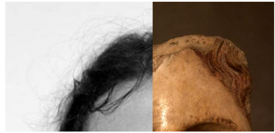
Author. Statue and Arrested Woman. 2013.

[...] Criminalization is a bourgeois conceit, [and] something we can afford to do because it is a relatively contained epidemic. And contained, importantly among those people who are socially marginalized and have relatively little social capital: sex workers, drug users, men who have sex with men, migrants from sub-Saharan or endemic areas of the world where HIV is endemic. That's what we learn about in the context of this. It's the fear that the majority has of the minority, the fear if you like, that the virus will escape into the "normal" population. And its very easy to satisfy a popular call to punitive response by saying "don't worry, we are going to criminalize the people who already have no access to the institutions (of perhaps), or have less access to popular, or media to put that case on, or have very little social or economic capital.<sup>53</sup>