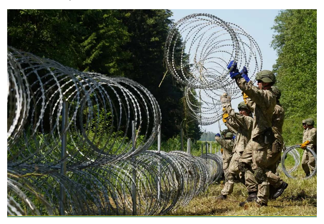
Lithuanian soldiers install razor wire on the border with Belarus in Druskininkai.