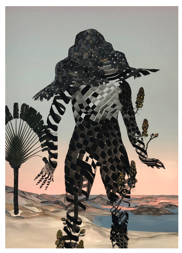
shroud (in threadbare light) 1, 2020 40"x 72", Acrylic, pigment, gesso on canvas