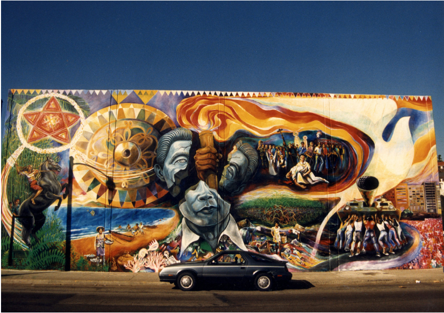
Lakas Sambayanan (People Power Mural) , 1986 Alemany Blvd., San Francisco, Acrylic on concrete