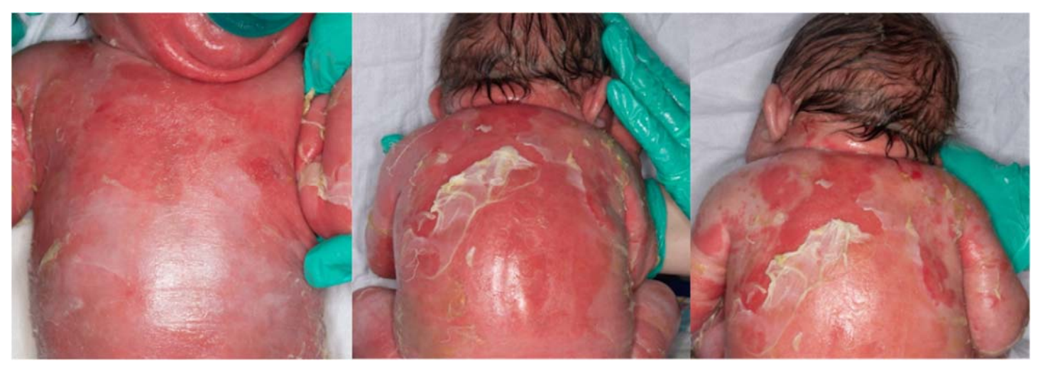
Figure 3 . Day of life 9. Diffuse erythema with variable desquamating erosions and plaques, accentuated at sites of pressure. This change in physical examination prompted skin cultures and subsequent diagnosis of staphylococcal scalded skin syndrome.

as a de novo mutation in patients with El and epidermolytic hyperkeratosis with palmoplantar involvement [6,7]. The variant is reported in the ClinVar database (Variation ID: 66648), but is absent from the genomAD population database and is thus assumed to be rare [8]. This substitution occurs within the helix initiation motif, a known mutational hotspot region. Mutations affecting the helix initiation, central rod domains, and termination motifs disrupt keratin intermediate filament assembly and function leading to hyperkeratosis and skin fragility [8,9]. One case report documenting the same mutation as observed in our patient detailed a sporadic case of El that presented with blisters, erosion, and erythroderma on the entire body