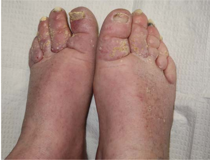
Figure 5. Improved thyroid dermopathy of the feet 18 months post-treatment with teprotumumab.

treatment with teprotumumab, the only IGF1R inhibitor approved to treat patients with thyroid eye disease. IGF1R activation enhances the effects of TSH receptor autoantibodies in orbital fibroblasts [10]. This stimulation leads to glycosaminoglycan accumulation and a T cell-mediated inflammatory cascade, resulting in the classic clinical manifestations of TED, including proptosis, extraocular muscle expansion and fibrosis, eyelid retraction, and periocular inflammation [11].