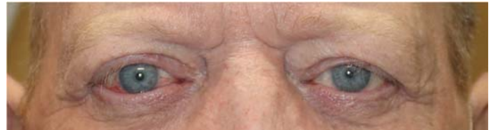
Figure 4. Improved bilateral exophthalmos and periorbital inflammation three months post-treatment with teprotumumab.

supplementation. Although his thyroid function stabilized on levothyroxine, his TED and TD continued to progress. He deferred all surgical interventions and was maintained on maximal medical therapy for ocular surface exposure symptoms. His custom footwear was adapted as needed, increasing from size 11 to 17 over the course of three years. In April 2020, the patient elected to proceed with teprotumumab treatment to reduce significant bilateral proptosis, periorbital inflammation, upper and lower lid retraction, and severe ocular surface exposure symptoms ( Figure 3 ). The regimen consisted of one dose of intravenous teprotumumab at 10mg/kg followed every three weeks with 20mg/kg/dose for seven additional infusions. After the first four infusions, he noted subjective improvement in his TED and TD. He also noticed mild constant muffled hearing but elected to continue treatment because he believed the benefits to his eyes and feet substantially outweighed his hearing changes. By the completion of his treatment regimen, his proptosis, eyelid retraction, periorbital inflammation ( Figure 4 ), and lower extremity edema ( Figure 5 ) had significantly improved. To date, 18 months after finishing teprotumumab, his eyes and feet remain stable but he still reports muffled hearing.