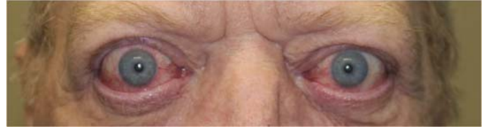
Figure 3. Bilateral exophthalmos, eyelid retraction, ocular surface exposure with conjunctival injection pre-treatment.