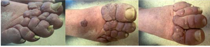
Figure 1. Thyroid dermopathy of the feet with acropexy of the toes pre-treatment.

documented. We present a patient with long-term resolution in TD (PTM with severe acropachy) after teprotumumab treatment of TED.