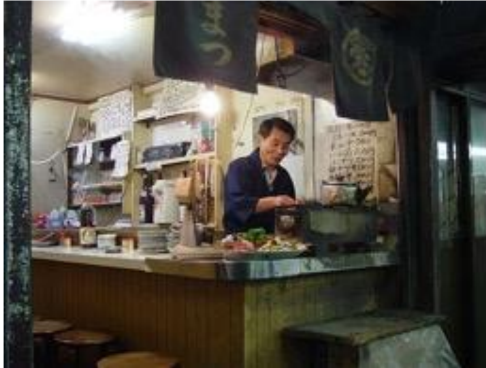
Fig. 5. Hole-in-the-wall . Tiny, semi-legal eateries fill pockets of the city. Tokyo, Japan, 2005.

Buddhism, with its emphasis on life's mutability, merges with this ideal. Time is not something to be overcome by struggle; it is rather to be lived with through acceptance of its laws. The Japanese value mono no aware is the sad, ephemeral and transient beauty of things. Mono is Japanese for "object" and aware is the sound of the sigh uttered when experiencing beauty (Andrews 29-30). The cherry blossom is of great cultural importance; it blooms for only about a week a year and its ephemeral beauty is celebrated by night long celebrations called hanami 花見 or "flower viewing." An object that ceases to function is more likely thrown away than repaired, since it has already lost its value anyway by ceasing to be new. Similarly, a building that requires serious renovation is more than likely replaced by an entirely new one, for the "the world is but a transient abode," and nothing must strive for permanence. Tokyo is organic, formed by the perpetual formation and reformation, even severing and discarding, of its parts. Like a hole-in-the-wall yakitoriya built (and subsequently demolished) by its owner, transience itself is a spectacle (Fig. 5).