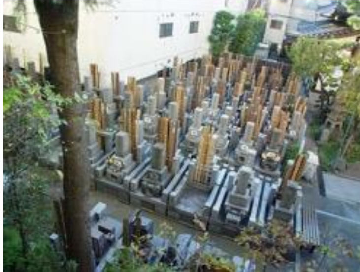
Fig. 9. The End of Rationalism . Today the only grid-like arrangement to remain in Tokyo is the cemetery. Tokyo, Japan, 2005.

History and memory are incompatible. Transcription of socially or political occurrences that are then regurgitated into what is commonly labeled as "culture" has a similar effect on memory as the blanket bombing of WW2 did on the city of Tokyo. History eradicates, obliterates, destroys memory. History and memory involve different conceptions of what is "past" and what is "present," and reading recent history, one is always under the impression that "this is not how I remember it." The event is still alive in the cultural consciousness, its resonance is still felt, and yet it is written down, transcribed, taught to young children at school. As Chris Marker asks in Sans Soleil , "Do we know where history is really made?" Less recent history is simply old enough to be considered "past," it falls outside our realm of experience and is foreign enough to be labeled "history." Tokyo is a city with no immediate past, and hence no recent history. Post-war events are still quite alive, and these still-vivid images can be traced in various aspects of the social and economic fabric. This is purely the realm of memory, the yoin of the nuclear bombs that drew a bold line between the nation's immediate present and very distant past. The threat of global oblivion is all but forgotten (i.e. relegated to the realm of history), but the personal wound lives on (it is in the realm of memory).