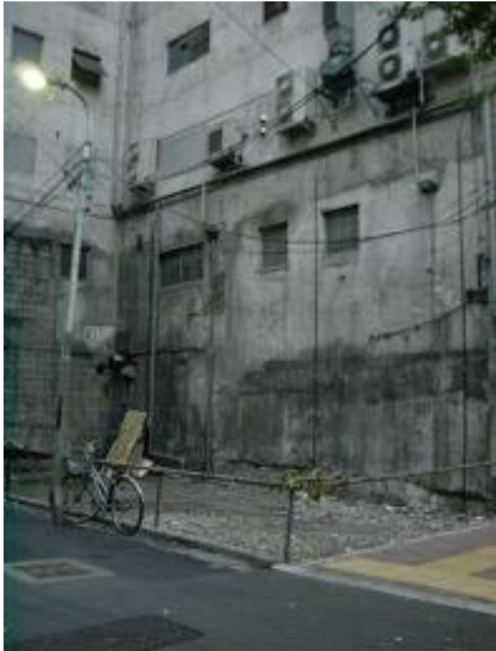
Fig. 8. Terrain Vague . One of a small handful of empty lots in the city, this one just off Ginza Street. Tokyo, Japan, 2015.

Nothing sorts out memories from ordinary moments. Later on they do claim remembrance when they show their scars. Chris Marker, Sans Soleil .