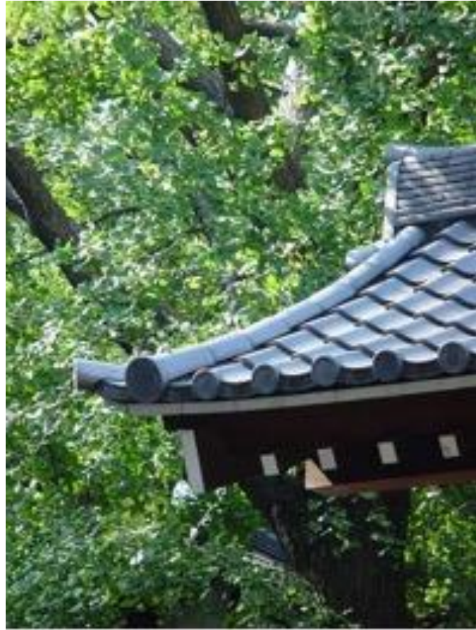
Fig. 6. Blurred Lines . The edge between architecture and nature, permanence and transience is fluid. Tokyo, Japan, 2005.

The transience of all things and the erosive power of nature and time over man and matter are tragedies that the West attempts to defy. The Western values being over non-being and its architecture (at least that of symbolic value) is built to stand the ages. Transience in Japanese philosophy, however, is not tragic and emptiness is not feared, but embraced: Zen speaks of the void as rich and full of meaning and possibility and of mushin 無心 or "anti-mind," which is unity with nature and the resignation to fate (Michihiro 227). Mushin are the gaps between things: spaces in a painting, blanks between lines in literature, silences between spoken words, stillnesses in motion. The teachings of Judo, Japanese martial art, derive from the related notion of mui 無為 or "anti-action" to defeat the opponent by using his own strength against him. The way of nature ( shizenkan ) is the unaffected and automatic power of spontaneous self-development and what results from that power (Andrews 17). While the West stands stubbornly in the face of the storm, Japan resigns itself to the power of shizenkan and lets itself be carried away by its winds. Traditional Japanese architecture is built with wood, which embraces nature and yields to time. Communication itself is highly non-verbal, higengo (literally "anti-word") and relies more on silence and ellipsis than on words and utterances (Fig. 6).