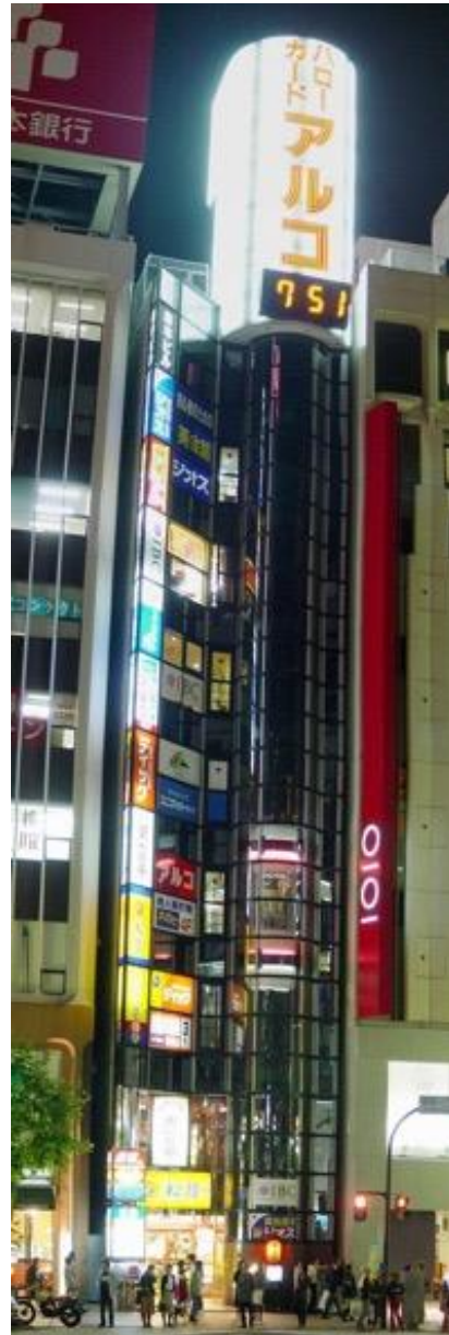
Fig. 2. Squeezed In . Buildings seem to compete for space. Tokyo, Japan, 2005.

Even if the street was empty, I waited at the red light—Japanese style so as to leave space for the spirits of the broken cars. Even if I was expecting no letter, I stopped at the general delivery window for one must honor the spirits of torn up letters. And at the air mail counter to salute the spirits of unmailed letters. I took to measure the unbearable vanity of the West that has never ceased to privilege being over non-being, what is spoken to what is left unsaid. Chris Marker, Sans Soleil .