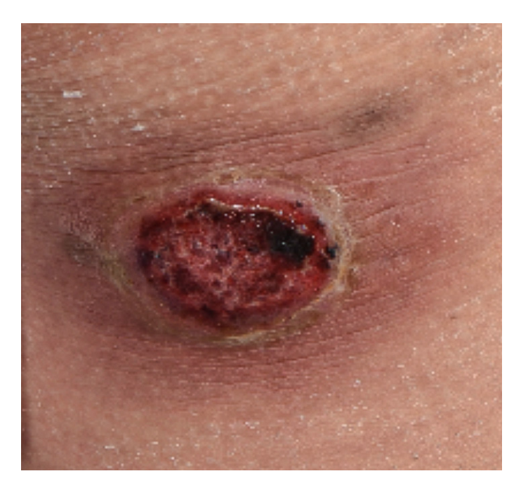
Figure 1 . A 2.5cm×2.0cm eschar overlying the center of a tender, erythematous, indurated, dermal/subcutaneous plaque on the right posterior thigh.

clearing ( Figure 2 ). With the working diagnosis of an infectious panniculitis and abscess with secondary cutaneous small vessel vasculitis, he was admitted for further workup and commenced on intravenous amoxicillin-clavulanic acid.