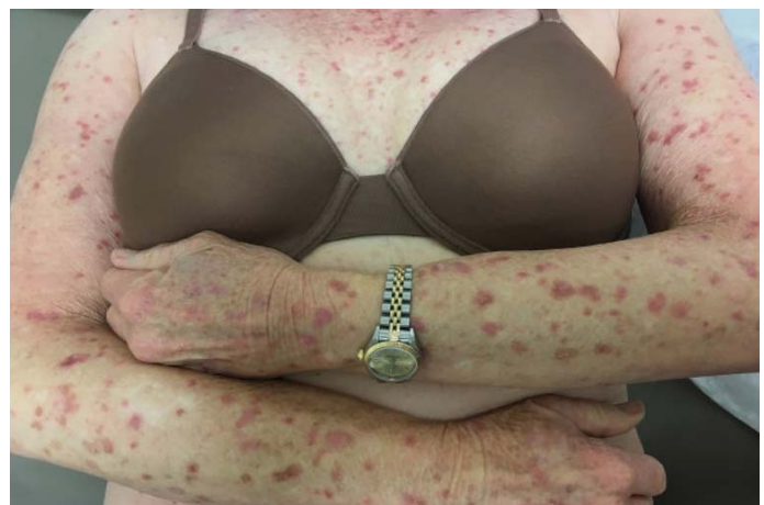
Figure 1. Chemotherapy-induced inflammation of disseminated superficial actinic porokeratosis (DSAP): Exam revealed a numerous amount of scattered inflamed appearing reddish-brown thin papules with collarettes of scale distributed on the chest, arms and legs occurring 1 week after initiation of chemotherapy.

Although inflammation of pre-existing DSAP has been described previously in the literature, namely with temozolomide (an alkylating agent) and