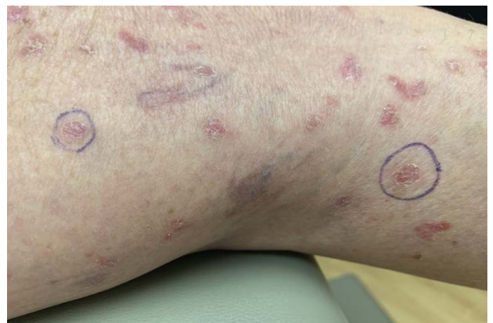
Figure 3. Between chemotherapy cycles (given every 6 weeks), the patient’s skin lesions appeared less inflamed and resembled her baseline exam, showing light erythematous to pink thin papules with a distinctive peripheral keratotic ridge.

One week after initiating treatment with durvalumab/olaparib/paclitaxel, the previously documented lesions of DSAP became inflamed and deeply erythematous ( Figure 1 ). Interestingly, she denied pruritus or pain. Review of systems was negative for fevers, chills, joint pain, photosensitivity, blisters, or oral lesions. Physical examination revealed scattered red-brown, thin papules and plaques with thread-like scale at the perimeter, widely distributed on the chest, arms, and legs with sparing of the back, abdomen, head, palms, and soles ( Figure 1 ). Punch biopsy from the right thigh showed variable acanthosis and keratinocyte dysmaturation with random bizarre nuclei in concert with dyskeratotic keratinocytes ( Figure 2A ). A subtle tier of parakeratosis was also apparent. There was initial concern for toxic erythema of chemotherapy or PD-1-induced lichenoid drug eruption purely based on histopathologic findings. Additional shave biopsies were taken at a follow-up appointment in-between the patient’s chemotherapy cycles and showed classic coronoid lamellae on several sections without keratinocyte dysmaturation ( Figure 2B ). Three weeks after her first chemotherapy cycle, all