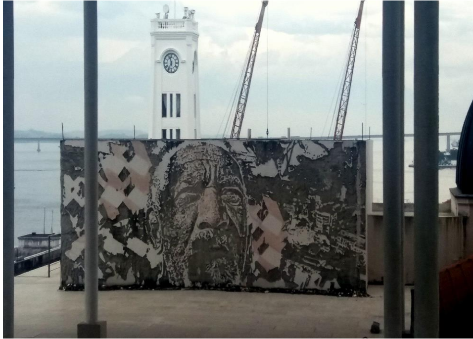
Fig. 5. Vhils' work at the Museum of Art of Rio (MAR).