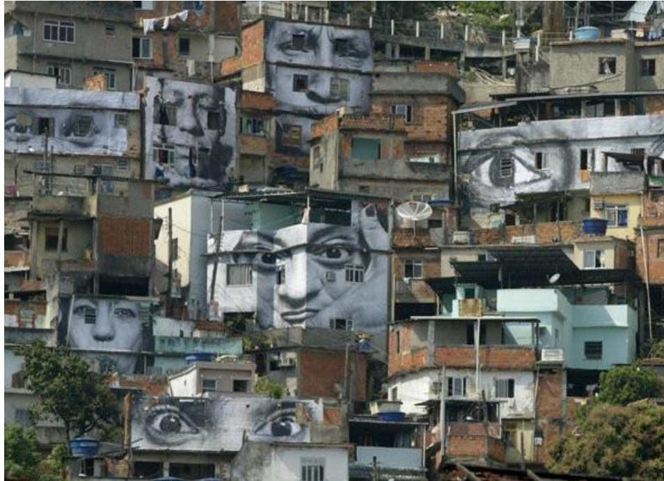
Fig. 1. J.R.'s installation at Morro da Providência. Source: http://g1.globo.com/Noticias/Rio/0,,MUL724088-5606,00-ARTISTA+INSTALA+OLHOS+EM+CASAS+DA+PROVIDENCIA.html