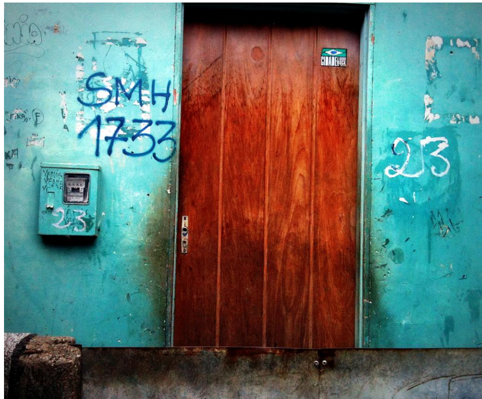
Fig. 2. House marked by the Municipal Department of Housing (SMH) in Morro da Providência.

addition to removals, issues such as the UPPs, the privatization of public space, and popular uprising. It is also worth noting that this practice was not specific to Providência: the mark “SMH” followed by a number can be seen on the houses of several communities in Rio de Janeiro, where removal processes are under way (Fig. 2). In an act of protest to these actions, street artist Kamuro Rioga spray-painted the same acronym in several buildings of Rio’s prime area: South Zone. According to activist, his “SMHs” are a response to City Council’s own vandalism: “It is a discussion on what vandalism is about. Is it about the SMH you see on a building in South Zone, or is it about what City Council does in the hills?” (Kuhnet).