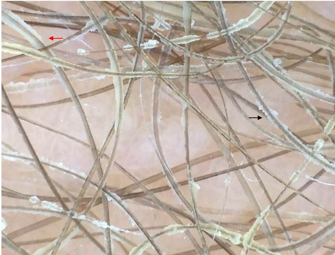
Figure 4. Dermoscopic study: Close-up picture of polarized dermoscopy revealing a flame-like aspect (black arrow) of pale yellowish adherent nodules and concretions and the plume sign (red arrow)