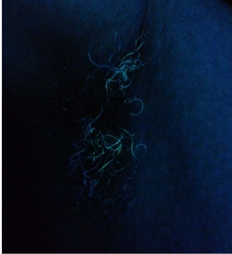
Figure 2. Wood's light examination reveals pale-yellow fluorescence

A 34-year-old man was admitted to the outpatient department reporting excessive sweating in his axillae and unpleasant odor for many years. On physical examination, it was noticed that his axillary hair was surrounded by soft, waxy, and yellowish concretions (Figure 1). Wood's light examination reveals pale-yellow fluorescence (Figure 2), but the skin of the axilla showed no coral red fluorescence, ruling out erythrasma. Dermoscopy images were taken to improve the diagnosis (Figures 3 and 4) and showed waxy and yellowish adherent nodules and concretions along the entire length of the hair of the axilla, a skewer sign, and a plume sign, a flame-like pale yellowish adherent nodule. The patient was treated by shaving the axillae and using topical erythromycin 2%. Currently, the patient is in remission and has improved his level of hygiene with regular bathing and frequent shaving of axillary hair to prevent recurrences.