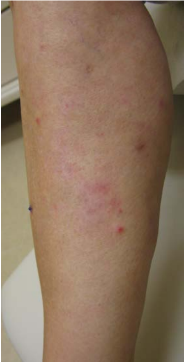
Figure 2. Two weeks later, right shin demonstrating new erythematous papules and interval resolution of some papules with varioliform scarring

with CD8 that was confined to the small lymphocytes. Histologic findings, in the context of the patients' clinical course, were consistent with type A lymphomatoid papulosis (LyP).