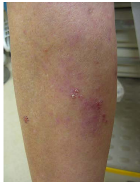
Figure 1. Erythematous, minimally blanching papules of the right shin with biopsy site outlined

Physical examination revealed crops of erythematous papules on her legs, slightly blanching, some with a collarette of scale (Figure 1). There was no appreciable lymphadenopathy or hepatosplenomegaly. The patient's medical history was otherwise unremarkable and she denied any systemic symptoms. Complete blood count with peripheral smear, basic metabolic panel, erythrocyte sedimentation rate, antinuclear antibody titer, rheumatoid factor, lactate dehydrogenase, and HIV testing were normal. On examination two weeks later the patient had spontaneous resolution of previous lesions, some with residual pink macular scarring, as well as the development of new papules (Figure 2). A 4-mm punch biopsy was obtained from a recent papule on her right shin and histologic analysis was performed, revealing a normal epidermis with a dense perivascular and interstitial infiltrate occupying the superficial and mid dermis (Figure 3). The infiltrate was composed of large atypical lymphocytes mixed with smaller normal appearing lymphocytes and numerous neutrophils. The atypical lymphocytes displayed characteristic cytoplasmic staining for CD30. There was minimal staining