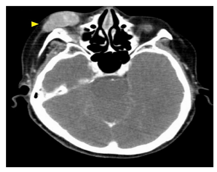
Figure 2 Computed tomography of the primary tumor invading the orbit (arrowhead).

The patient initially refused surgery because she was concerned about the poor cosmetic outcome of the surgery and eyelid dysfunction. Therefore, we