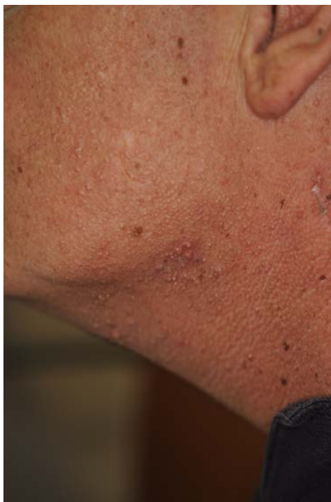
Figure 1. Radiation-induced acne with follicular papules with few pustules and closed comedones

Case #2: A 58-year-old man was undergoing treatment for a locally advanced mucosal melanoma of the nasal cavity. Treatment initially combined cisplatin chemotherapy with radiotherapy confined to the tumor bed (66 grays in total, 2.2 grays per session, 5 days a week for 6 weeks). After 3 weeks of radiotherapy, a number of open comedones, microcysts, and closed comedones appeared in the radiotherapy field (Figure 2). There were no associated papular or pustular inflammatory acne lesions. Histological examination revealed open and closed comedones containing keratin plugs (Figure 3). All the comedones lesions regressed within a few weeks after physical extraction.