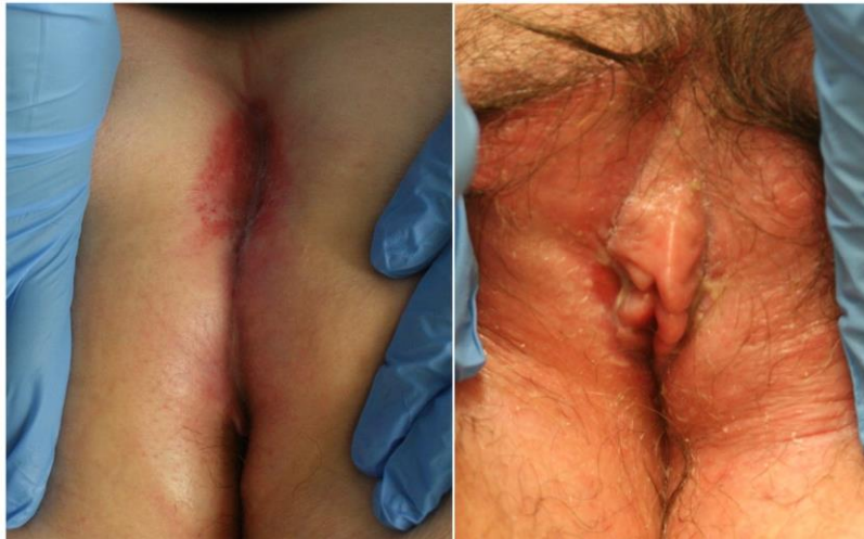
Figure 3. Anogenital area after one and a half year of ustekinumab treatment. (Left panel), Perianal plaque has resolved, leaving an asymptomatic erosion. (Right panel), Improved clitoromegaly and asymptomatic vulvar superficial erosions.

Seven months after starting the treatment, the patient's perianal ulcerated plaques and clitoromegaly had largely resolved, leaving only a few asymptomatic erosions. The patient continues to be free of cutaneous and gastrointestinal symptoms one and a half years after beginning ustekinumab (Figure 3). She has not experienced any adverse events to date.