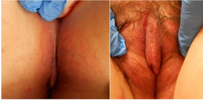
Figure 1. Anogenital area of the patient before ustekinumab treatment. (Left panel), indurated firm plaque at the midgluteal cleft. (Right panel), Indurated erythematous labia majora with bilateral vulvar ulcers and clitoromegaly.

Because the patient's cutaneous disease continued to be bothersome, she re-presented to dermatology clinic. Physical examination revealed an indurated, ulcerated, and linear plaque on the perianal skin as well as clitoromegaly (Figure 1). Prior biopsy of the gluteal cleft plaque, taken at the initial presentation for cutaneous disease, showed granulomatous inflammation consistent with cutaneous CD (Figure 2).