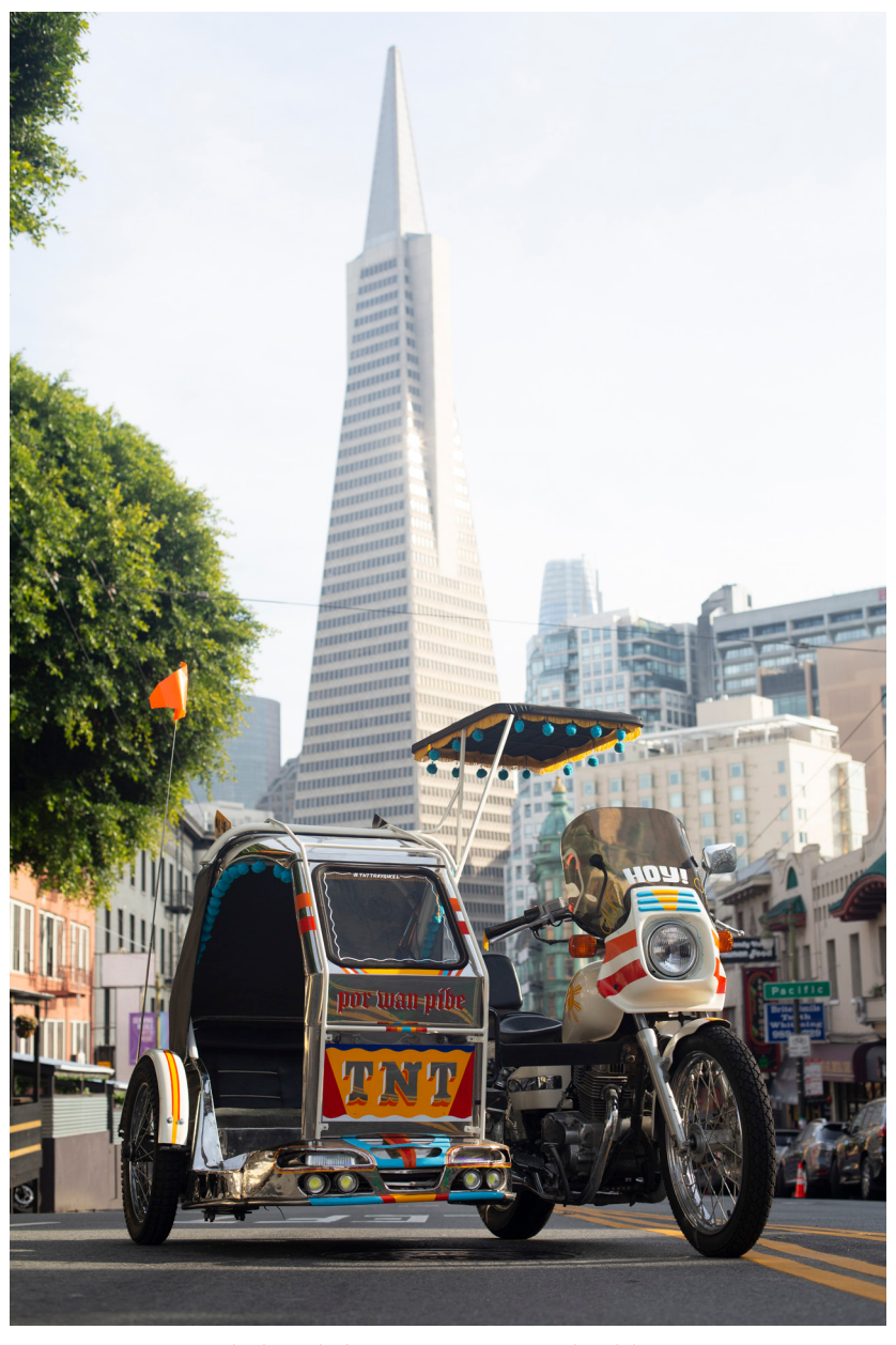
TNT Traysikel and the Transamerica building, an iconic San Francisco landmark.