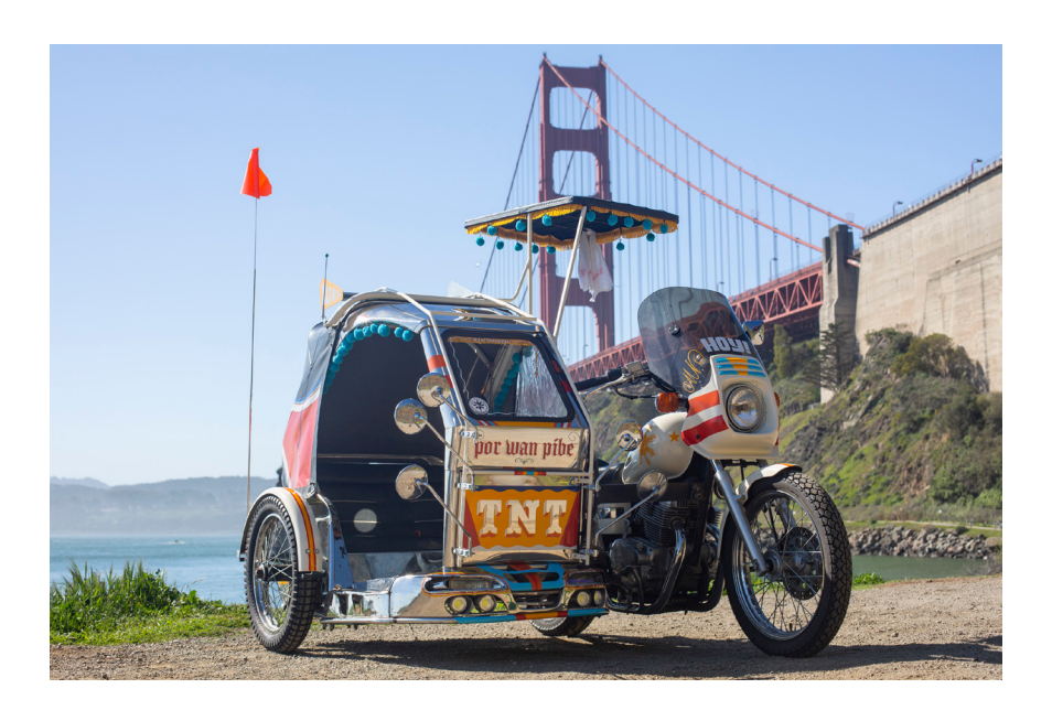
TNT Traysikel and the Golden Gate Bridge after crossing with the Norcal Pinoy Riders, a loose association of over 700 Filipino American motorcyclists in Northern California.