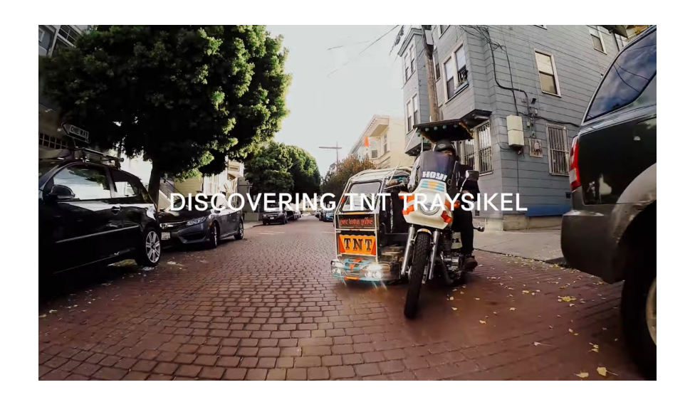
Hiraya Magazine Feature, Discovering TNT Traysikel. A film by Francis Gum. https://www.youtube.com/watch?v=yyYRsww0I2M&t=163s