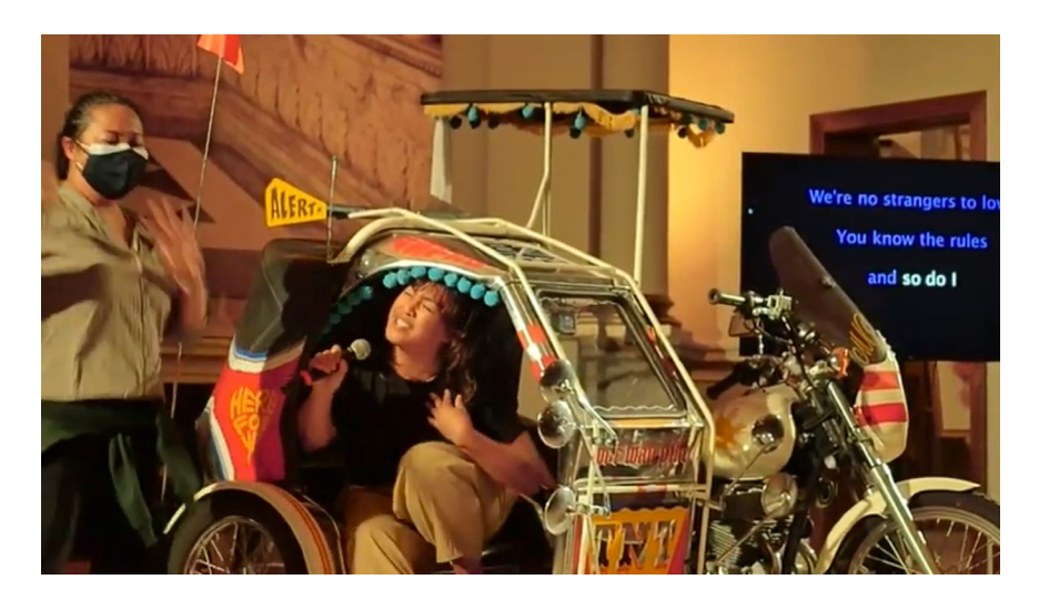
TNT SideCaraoke at Saint Joseph's Arts Society. https://www.youtube.com/watch?v=_fhZnCnm51M