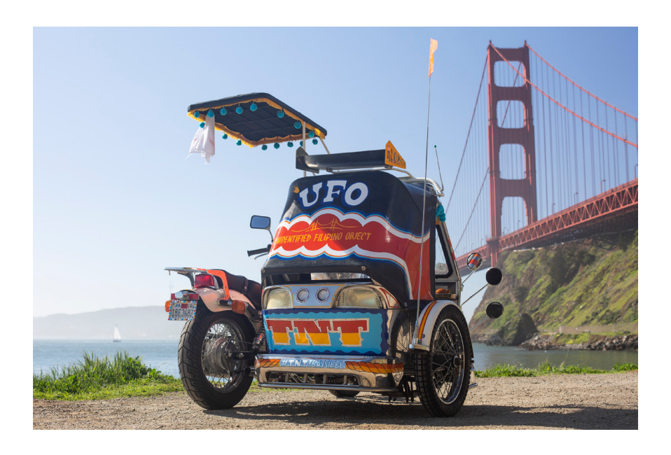
TNT Traysikel and the Golden Gate Bridge after crossing with the Norcal Pinoy Riders, a loose association of over 700 Filipino American motorcyclists in Northern California.