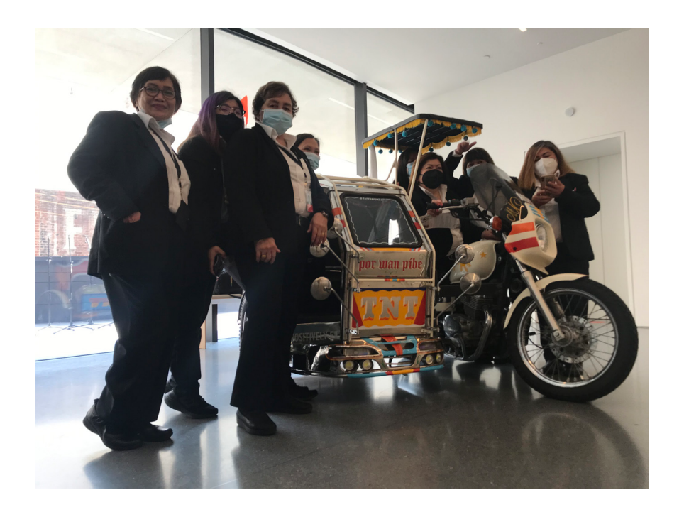
Pinay security guards at SFMOMA pose with TNT Traysikel like it's a family member visiting the museum at the Mini-Mural Festival at SFMOMA in San Francisco, CA.