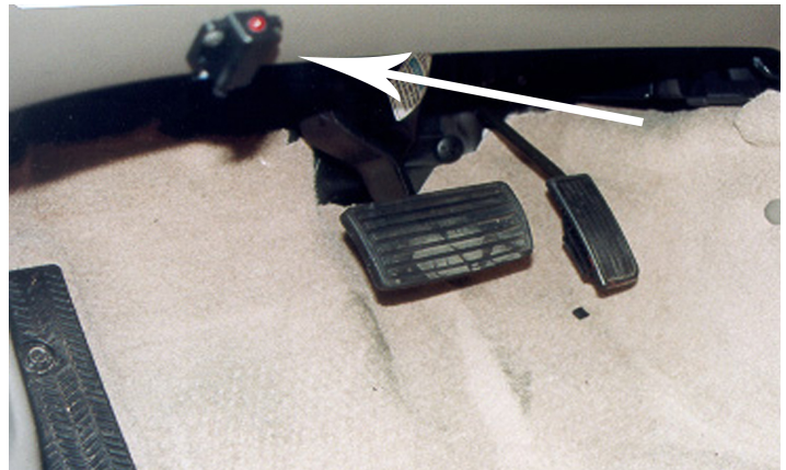
Figure 4. Car alarm LED

into three sections: crash variables, VAS and AIS injury assessments, and disability outcome predictions. Paramedic-reported crash variables were compared with the corresponding variables from the formal crash investigation report, which was considered the gold standard.