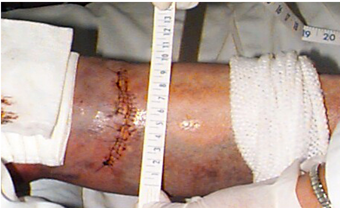
Figure 3. Left lower extremity laceration due to contact with car alarm LED