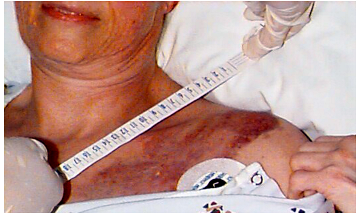
Figure 2. Seatbelt-related contusion and abrasion