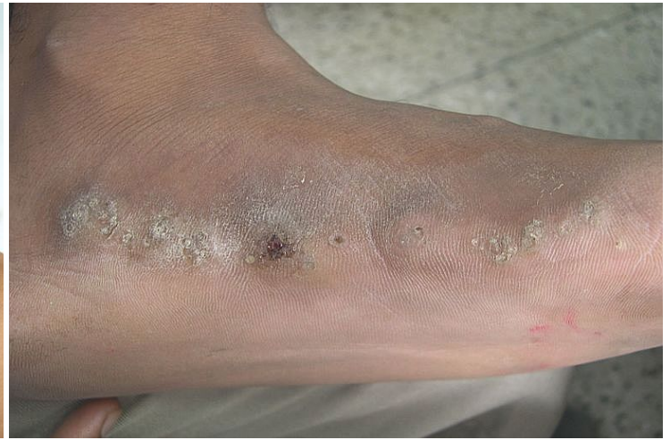
Figure 4. Verrucous papules , some with central pits

The rest of the mucocutaneous and systemic examination showed no gross abnormality. Linear porokeratosis, linear lichen planus, nevus comedonicus, and PEODDN were considered in the differential diagnosis.