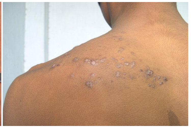
Figure 2. Hyperkeratotic papules over upper back in linear arrangement