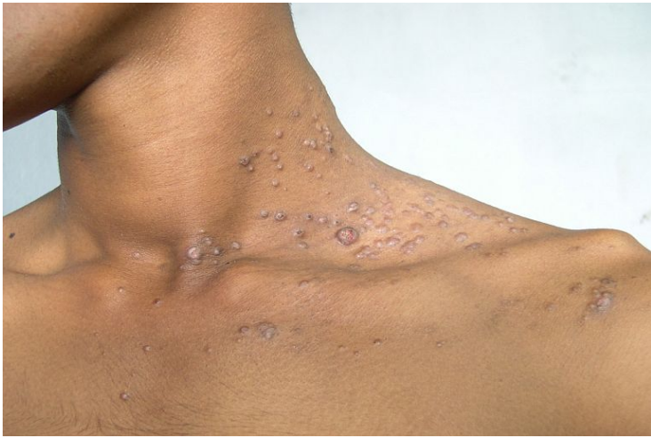
Figure 3. Hyperkeratotic papules with excoriations over left side of the neck, shoulder and upper chest