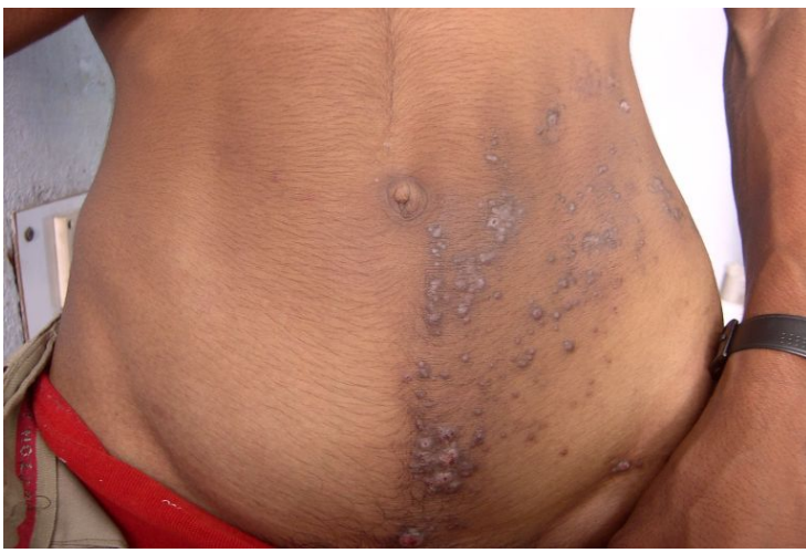
Figure 1. Keratotic papules over abdomen along Blaschko's lines