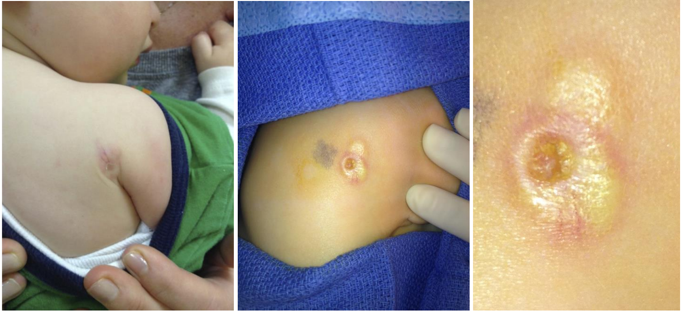
Figure 1A-C. (A) A well-demarcated, round, firm nodule with telangiectasia and a central depression located on the patient's posterior shoulder. (B) The same lesion at the time of excision under general anesthesia. The lesion and surrounding skin had been treated with betadine. Applying tension to the surrounding skin revealed the bulky nature of the lesion. (C) Close-up view of (B).

(myofibromatosis). We discussed the options of surgical excision versus careful monitoring for spontaneous resolution with the patient's parents. They preferred definitive treatment and opted for surgery. The lesions were excised under general anesthesia with a 3mm margin (Figure 2, A and B). After ten months of follow-up, there had been no evidence of recurrence.