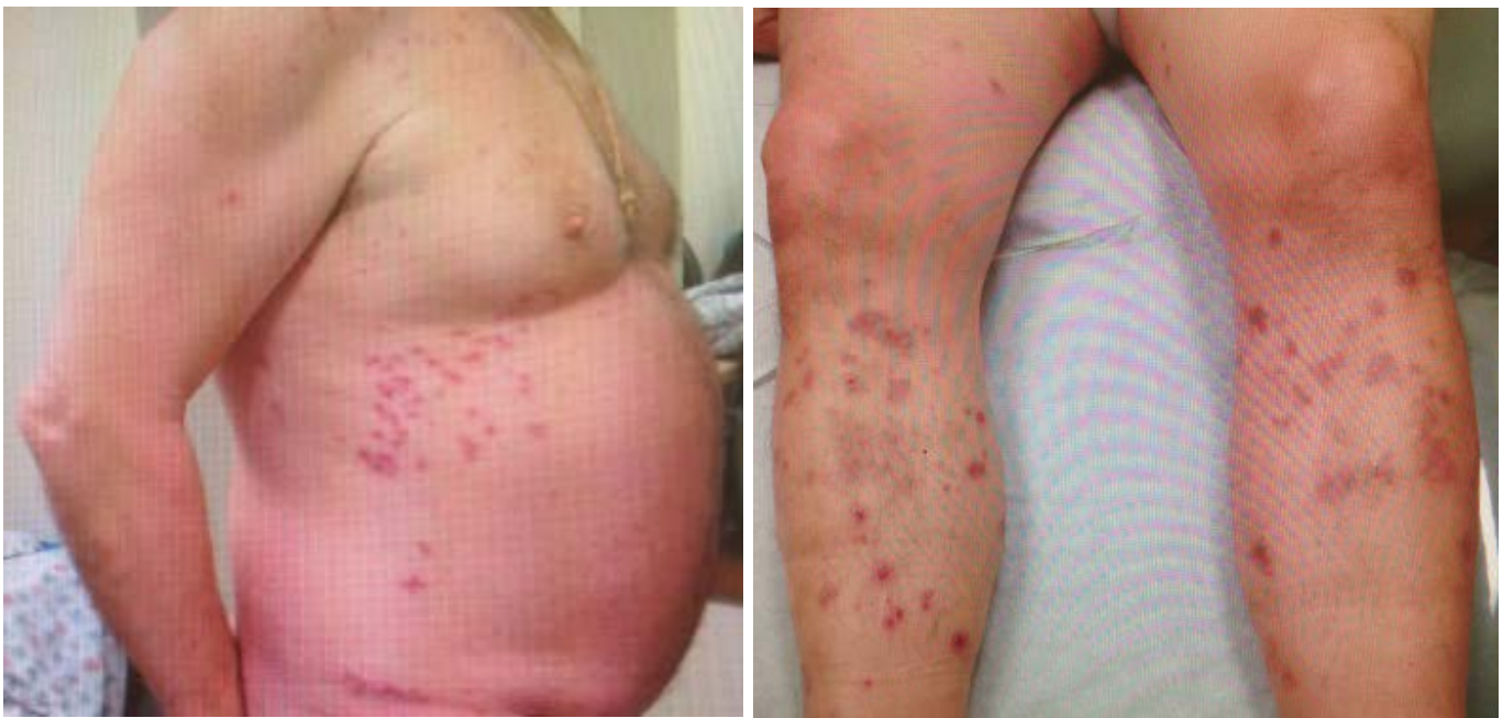
Figures 1,2. Erythematous, violaceous papules and nodules