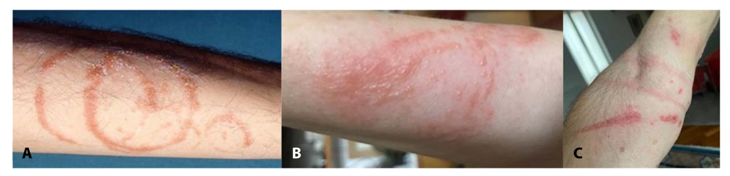
Figure 1. Patients A) 1, B) 4, and C) 5: erythematous-vesicular lesions on a forearm.

the undersurface of leaves can also be irritant [12]. Allergic contact dermatitis is uncommon. Phototoxic dermatitis is the most frequent clinical manifestation caused by Ficus carica L. The presence and levels of psoralens in Ficus carica L were studied: psoralen and 5-methoxypsoralen are present in appreciable quantities in the leaf and shoot sap, but they are not detected in the fruit or its sap [6]. This is the reason that the response follows contact with the leaf and shoot sap but not with the fruit sap [6]. Psoralen and 5-methoxypsoralen are more concentrated in the leaf sap in comparison with the shoot sap [6,17]. Psoralen levels are several times higher than those of 5-methoxypsoralen [6]. Lower concentrations of both compounds are present in autumn compared to spring and summer [6]. The higher content of psoralen and 5-methoxypsoralen in spring and summer can be responsible for the increased incidence of fig dermatitis during these seasons [6]. Ficus carica L also contains However. methoxypsoralen. Biopsies have been very rarely performed in patients with Ficus carica L photodermatitis [18,20]. However, this is important when the diagnosis is obscure because the presence