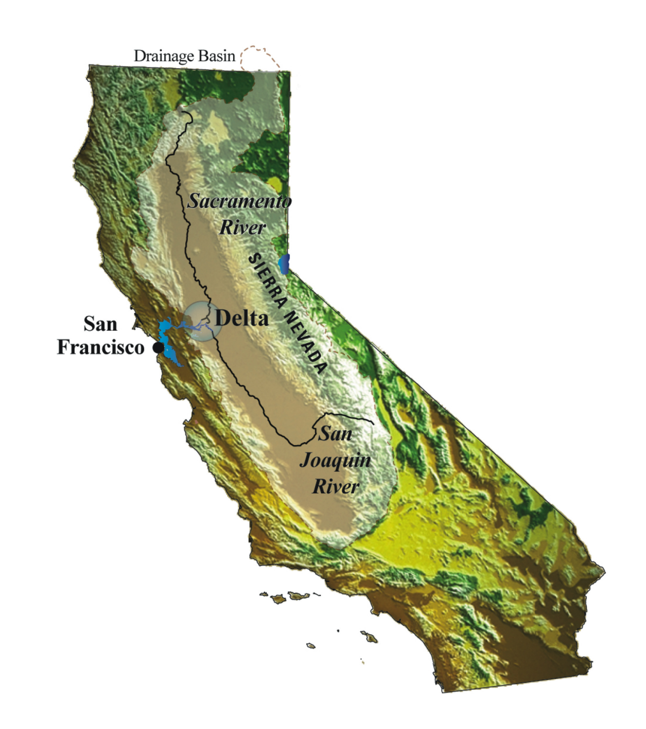
Figure 1. Location of the Sacramento-San Joaquin Rivers Delta in California and in relation to major geographic features.