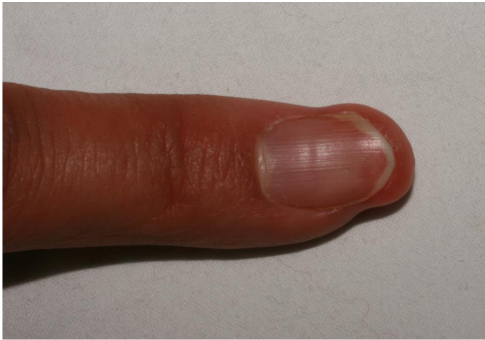
Figure 1. Nodule of right index finger pad

Based on these findings, the mass was considered to be a glomus tumor, neurogenic tumor, or digital aponeurotic fibroma; punch biopsy was performed. Histopathological examination of the biopsy specimen showed lobules of mature hyaline cartilage with chondrocytes in the lacunae in the dermal and subdermal layers. Mitotic figures and an increase in cellular atypism were not observed (Figure 2).