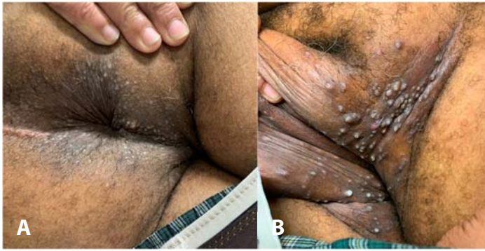
Figure 1. A) Well-healed linear incision and drainage scar on the gluteal cleft, with tender subcutaneous nodules and scattered erythematous follicularly based papules inferior to the scar. B) Worsening of indurated plaques and folliculocentric papulonodules in the bilateral inguinal folds during continued anti-PD1 therapy.

exhibited a progressive worsening course with HS flares following each nivolumab infusion. This treatment regimen was continued for five months until the patient worsened and presented with hyperpigmented indurated plaques and folliculocentric papulonodules symmetrically in the inguinal folds ( Figure 1B ). Two 4mm punch biopsies were performed, which demonstrated follicular-cystic dilatation with pseudoepitheliomatous hyperplasia ( Figure 2 ). These biopsy findings are consistent with HS and support the diagnosis given the clinical context characterized by a progressive course, symmetric lesions in the intertriginous areas, and worsening with nivolumab infusions. Humira was not initiated owing to concerns about immunosuppression in the context of the patient's