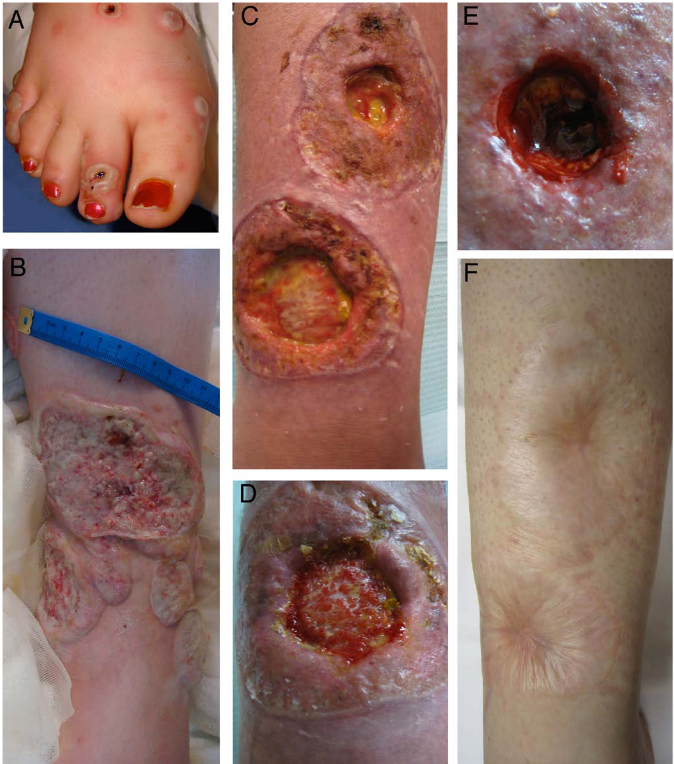
Figure 1. Clinical course of a PG patient treated with multimodal therapy.

On physical examination, numerous deeply ulcerated plaques with violaceous undermined borders were observed over the lower extremities bilaterally (Figure 1A and 1B). Beefy red granulation tissue with purulent exudate was visible at the wound beds. There were also multiple purpuric vesicles, bullae, and nodules scattered diffusely over the lower extremities with fewer lesions on her upper extremities. Lymphadenopathy and hepatosplenomegaly were not appreciated.