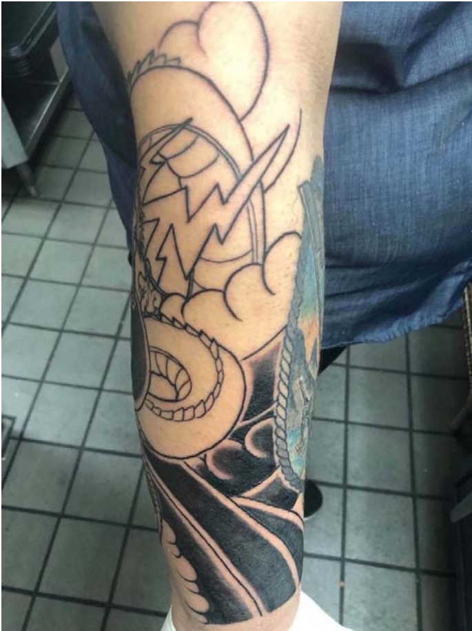
Figure 1. The patient's right dorsal forearm represents a picture of the tattoo the moment the procedure was completed and before the scented lotion was applied. This provides a baseline reference of the tattoo color saturation.

scales ( Figure 2 ). Given the history and timing of the reaction, his primary care physician did not refer the patient to a dermatologist for patch testing nor did he feel that a skin biopsy was warranted. The primary care physician recommended symptomatic treatment with ibuprofen for the swelling, application of an unscented lotion to control the pruritus, and avoidance of offending agents such as scented lotions. After day 2, the reaction subsided over days and the tattooed skin completely healed in three weeks. However, his tattoo continued to fade 6 months after the reaction ( Figure 3 ).