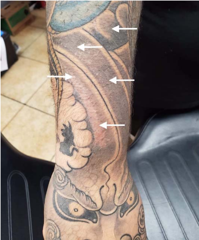
Figure 3. The patient's dorsal forearm represents the tattoo 6 months after the allergic contact dermatitis. Compared to Figures 1 and 2, there is significant color fading, change in texture, and scaring. The white arrows further represent the maximally involved areas.

had numerous potential allergens ( Table 1 ). Although the scented lotion was applied to all tattoos, only the healing tattoo developed an allergic reaction. Damage to the skin barrier from the tattoo procedure may explain why the topical scented lotion caused an allergic contact dermatitis on the fresh healing tattoo and not on the old healed tattoos [2]. In our patient the initial rapidity of erythematous reaction within minutes suggested an irritant contact reaction, the development observed