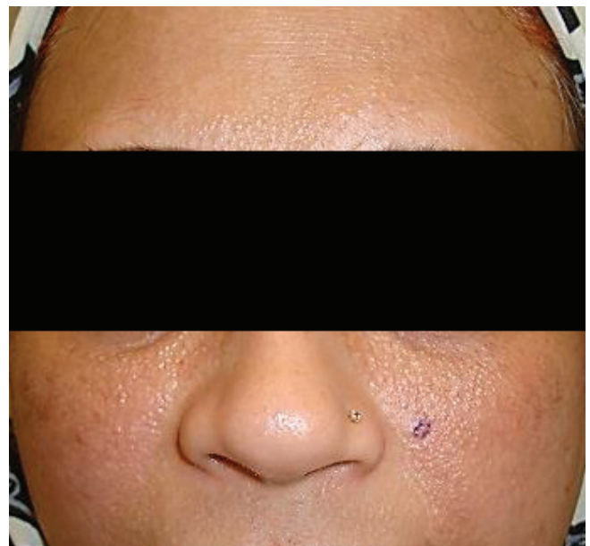
Figure 1. Many skin-colored and yellow, smooth 1-3 mm papules on the face, sparing the periorificial skin zones.

to this presentation, she had been treated for an acneiform eruption on her cheeks and forehead. At that time, she had presented with comedones and erythematous papules on the central area of the face and terminal hairs on the chin. She was initially treated with doxycycline 100 milligrams twice per day, benzoyl peroxide 5% gel, and tretinoin 0.05% cream for three months without improvement. She later developed erythematous papules that coalesced into plaques on her cheeks, and a diagnosis of pyoderma faciale was made. She was started on an oral contraceptive and subsequently treated with a four-month course of isotretinoin, with a cumulative dose of 7400 milligrams, (patient's weight was 65 kilograms) with appreciable improvement of her eruption.