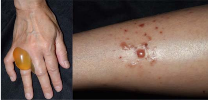
Figure 1. Tense bullae on the hands and lower legs.

weeks of treatment initiation without the use of immunosuppressive drugs.