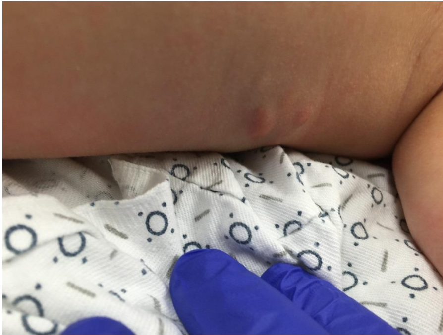
Figure 1. Clustered firm yellow to red-brown nodules on the left upper trunk of a 3-month old infant.

At 2-month follow-up the lesions had gradually continued to grow and coalesce. A 3-mm punch biopsy was taken from the left upper trunk (Figure 2).