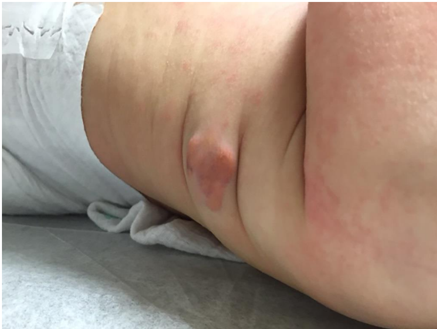
Figure 2. Gradual enlargement and coalescence into larger plaque at 2-month follow-up.

At 2-month follow-up the lesions had gradually continued to grow and coalesce. A 3-mm punch biopsy was taken from the left upper trunk (Figure 2).