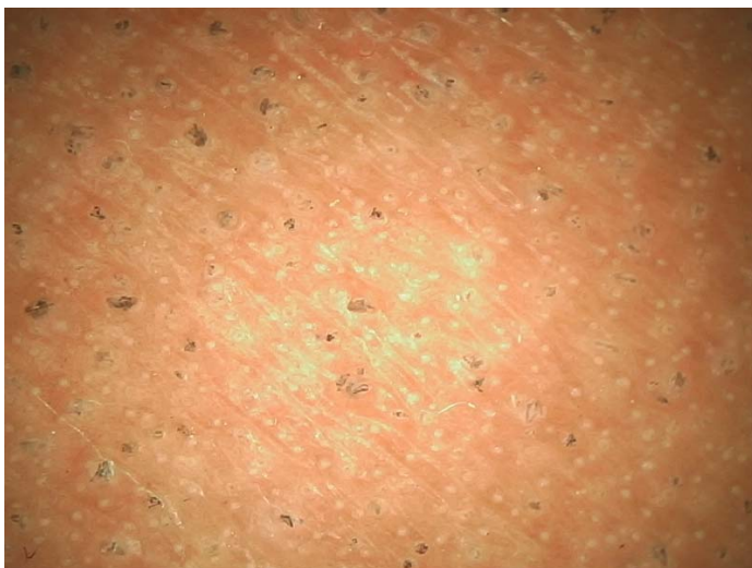
Figure 4. On trichoscopy, pin point white dots (3-4) arranged in clusters with no perifollicular pigmentation, inflammation or occlusion.

Trichoscopy (Mini 3000 LED Dermatoscope, Heine, Germany) showed pinpoint white dots arranged in clusters with no perifollicular pigmentation, inflammation, or occlusion ( Figure 4 ). The skin biopsy from a scalp papule revealed normal overlying epidermis with multiple keratin cysts and hypoplastic hair follicles in the upper dermis ( Figure 5 ). There were no terminal hairs or sebaceous glands. On the basis of clinical, trichoscopic, and histopathological findings we confirmed the diagnosis of congenital atrichia with papular lesions (APL).