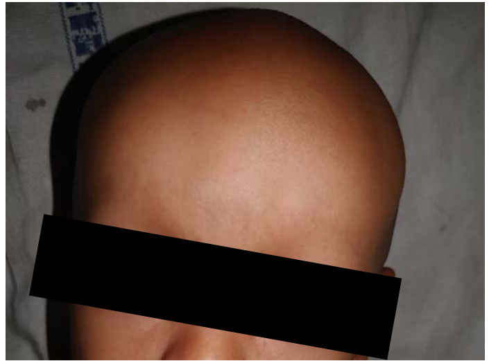
Figure 3. Complete absence of hair on the eyebrows and absence of majority of eyelashes. Few eyelashes present on both upper eyelids.

On examination, the patient had a complete absence of hair on the scalp, eyebrows, and eyelashes ( Figure 2, 3 ). Multiple, discrete, pearly to skin colored papules of 1-3mm in size were present over the scalp. He had no abnormalities of nails, teeth, mucosae, palms, and soles. His physical growth was normal according to age. No bony abnormalities, dysmorphic features, or systemic involvement was present. Blood counts and liver and renal profiles were normal. The Vitamin D3 levels (1,25-dihydroxycholecalciferol) were 20.44ng/ml (normal: 30-100ng/ml). Radiographs of the wrist joints were