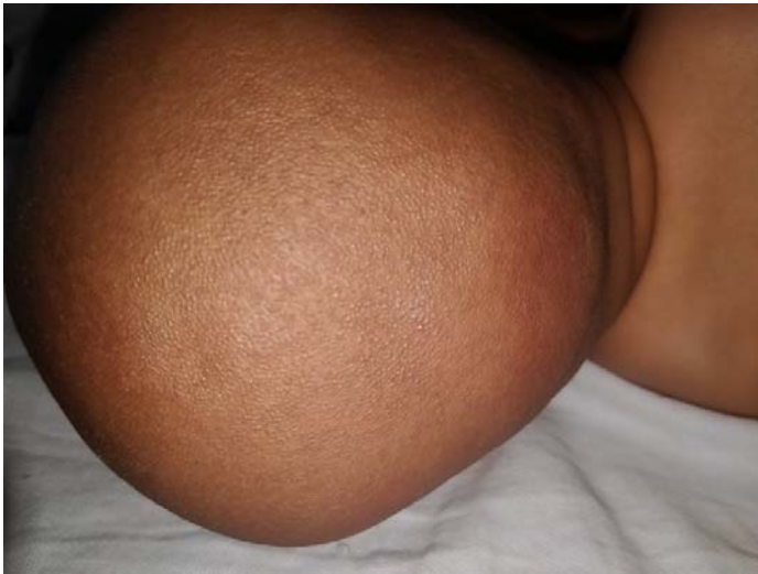
Figure 2. Multiple, discrete, pearly to skin colored papules of size 1-3mm were present over the scalp with complete absence of hair on the scalp.

On examination, the patient had a complete absence of hair on the scalp, eyebrows, and eyelashes ( Figure 2, 3 ). Multiple, discrete, pearly to skin colored papules of 1-3mm in size were present over the scalp. He had no abnormalities of nails, teeth, mucosae, palms, and soles. His physical growth was normal according to age. No bony abnormalities, dysmorphic features, or systemic involvement was present. Blood counts and liver and renal profiles were normal. The Vitamin D3 levels (1,25-dihydroxycholecalciferol) were 20.44ng/ml (normal: 30-100ng/ml). Radiographs of the wrist joints were